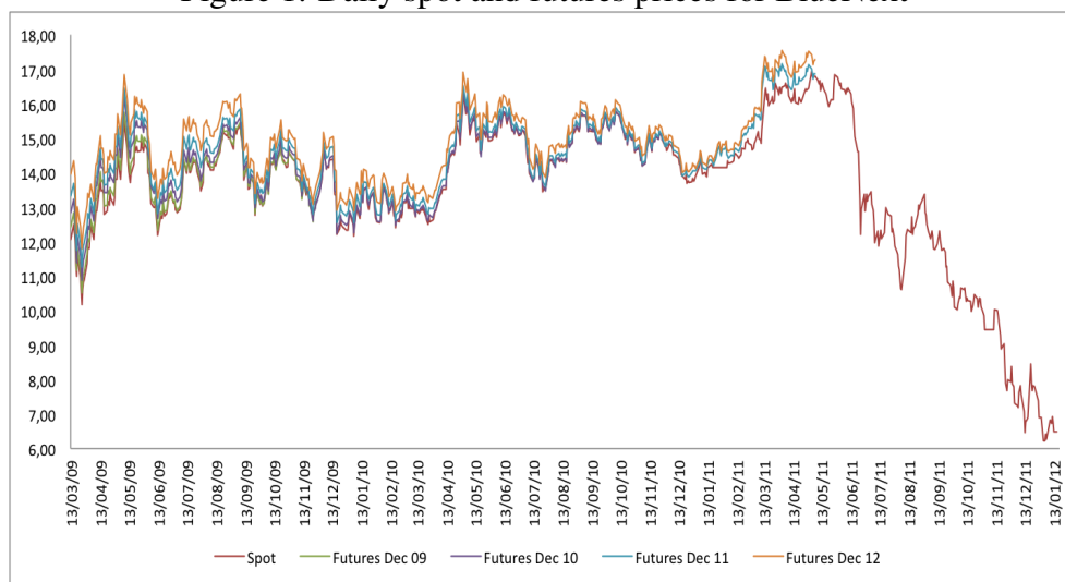
Figure 1: Daily spot and futures prices for BlueNext

The remainder of this paper is organized as follows: Section 2 presents the cost-of-carry model. A brief literature review is given in Section 3. Section 4 displays the cointegration tests with and without structural breaks. The empirical framework is discussed in Section 5. The conclusion is drawn in Section 6.