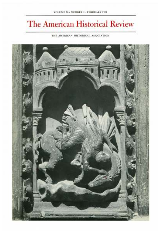
Fig. 2 – Front cover of The American Historical Review , vol. 76, n° 1 (Feb. 1971). Pride as a falling rider, ca. 1225. Chartres Cathedral. http://www.jstor.org/stable/1869773