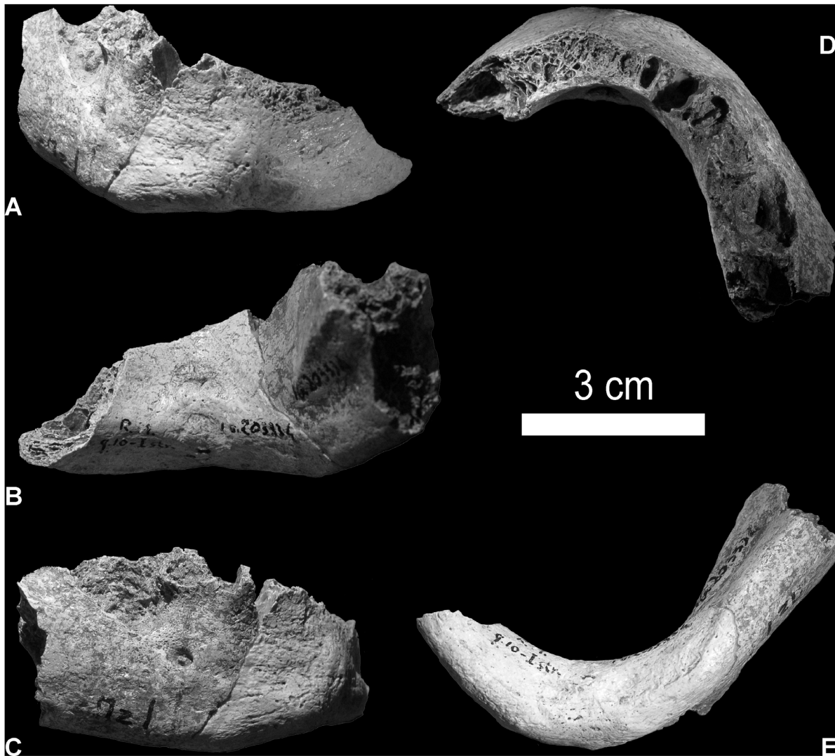
Figure 1. The mandible from Mezzena. Frontal view : A, internal view : B, lateral view: C, superior view : D), inferior view : E. doi:10.1371/journal.pone.0059781.g001

symphysis and of the incisura are similar to that found among classic Neanderthals, such as Guattari III or Regourdou from France. But this morphology is present in particular among late Neanderthals (e.g. St Césaire, Spy 1, La Ferrassie 1, Las Palomas 59 and Vindija [5,36]) and to a lesser extent among Neanderthals of the Near East (especially Tabūn II and Amud 1). All these fossils have an incipient mentum osseum . On the internal face of the symphysis (Figure 1B), the alveolar rim is severely damaged but the mental spines ( spinae mentales ) can be noticed below the fracture. They are clearly separated as on the Neanderthal La Ferrassie 1. Above these two spines a foramen spinosum is clearly visible. Under the upper mental spine there is a very slight half-moon shaped notch comprising the fossa genioglossa .