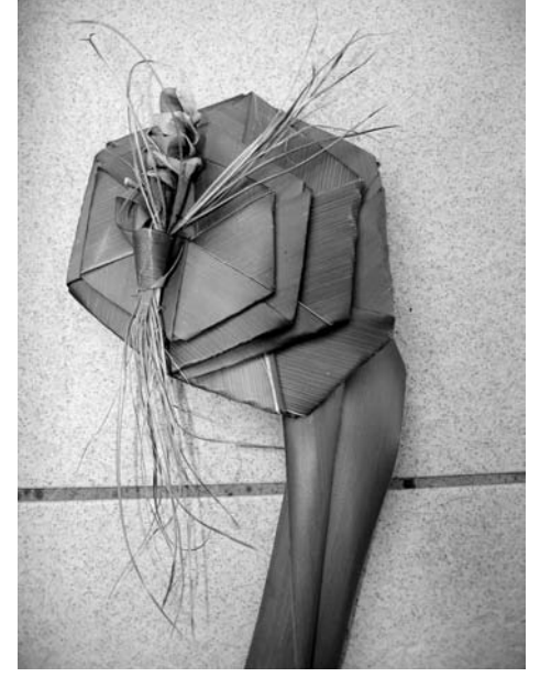
Figure 3: A flax flower.

the contemporary environmental issue of the disappearance of pingao , the grass used for the decorative panels in the wharenui . This reminder of the interconnection between craft with other aspects of life set the scene for a discussion about the origins and social importance of the conventions surrounding weaving. In the workshop we were able to undertake small weaving exercises of a much more creative nature than forming flat mats: flowers and fishes emerged from the long flax leaves.