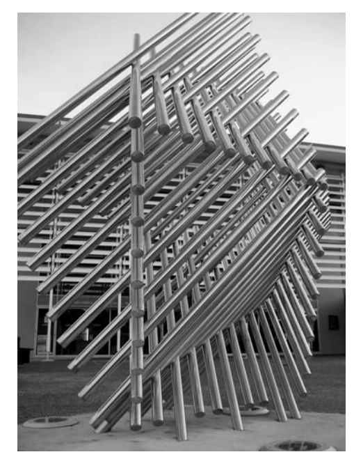
Figure 5: Tohi sculpture based on Lalava structures.

at educational outcomes and relationships with school mathematics curricula.