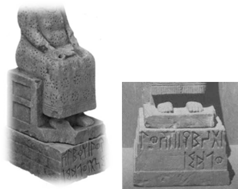
“Sitting woman”, Mäqabər Ga’əwa (near Makale), Addi Gelemo (RIE 52), 8 th -7 th c. BC