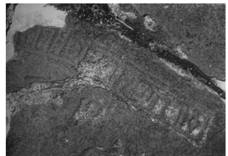
Graffito from Zeban Mororo (near Asmara), 8 th -7 th c. BC, “Monumental A/B” (RIE 124).

– Short inscriptions on different artefacts (about 15): the text is only a personal name, composed of a few letters or symbols, tidily arranged and sometimes enclosed in an animal form, and referred to as “property marks” [Anfray 1963 | Drewes, Schneider 1967];