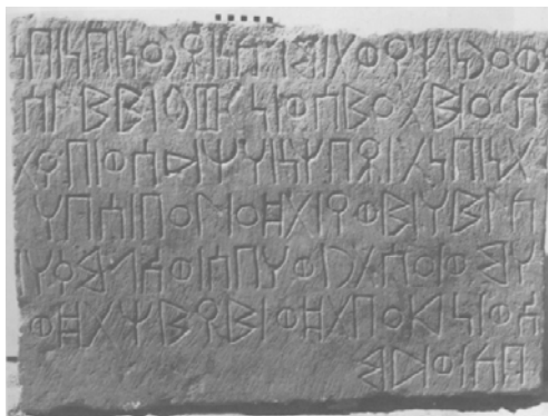
Monumental inscription from Amda Tsyon, Seglamen (near Aksum), “Monumental A”, 8 th -7 th c. BC (RIE 1).

= [symbol] w’rn / mlkn / šr’n / bn / rd’m / w-šhtm / ‘rkytn / hḥds / l-lm qh / ywm / tb’l / byt / ‘lmqh / b-yḥ’ / b-nhy / ttr / w-lmqh / w-ḏt-ḥmym / w-ḏt-b’ dn /