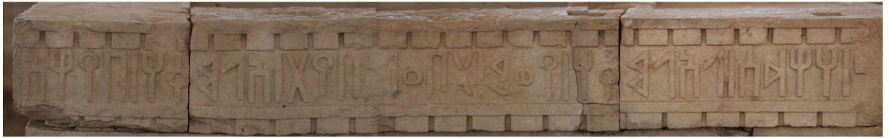
Altar of the temple at Mäqabär Ga'äwa, 7 th c. BC: W'rn the victorious king, son of Rd'm, and Šḥtm r[ktn] erected (this monument) for Almaqah, when he constructed (?) the temple of Almaqah at Yḥ', with the guidance of 'Attar, Almaqah, dāt-Ḥimyum and dāt-Ba'dan (interpretation I. Gajda).

Both of these practices are not attested in South Arabia and seem thus specific to the local population of North Ethiopia at that time.