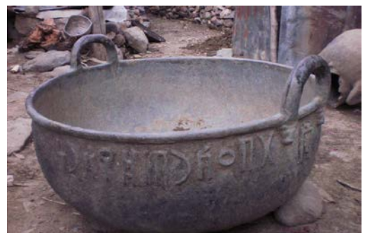
Henzat, bronze caldron with personal name.