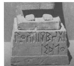
“Sitting woman”, Mäqabər Ga’əwa (near Makale), Addi Gelemo (RIE 52), 8 th -7 th c. BC