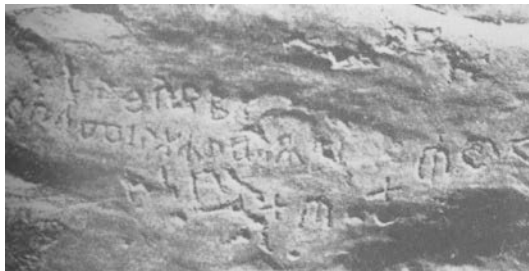
Graffiti from Dakhanamo, Kotar (near Asmara), 8 th -7 th c. BC (RIE 157).