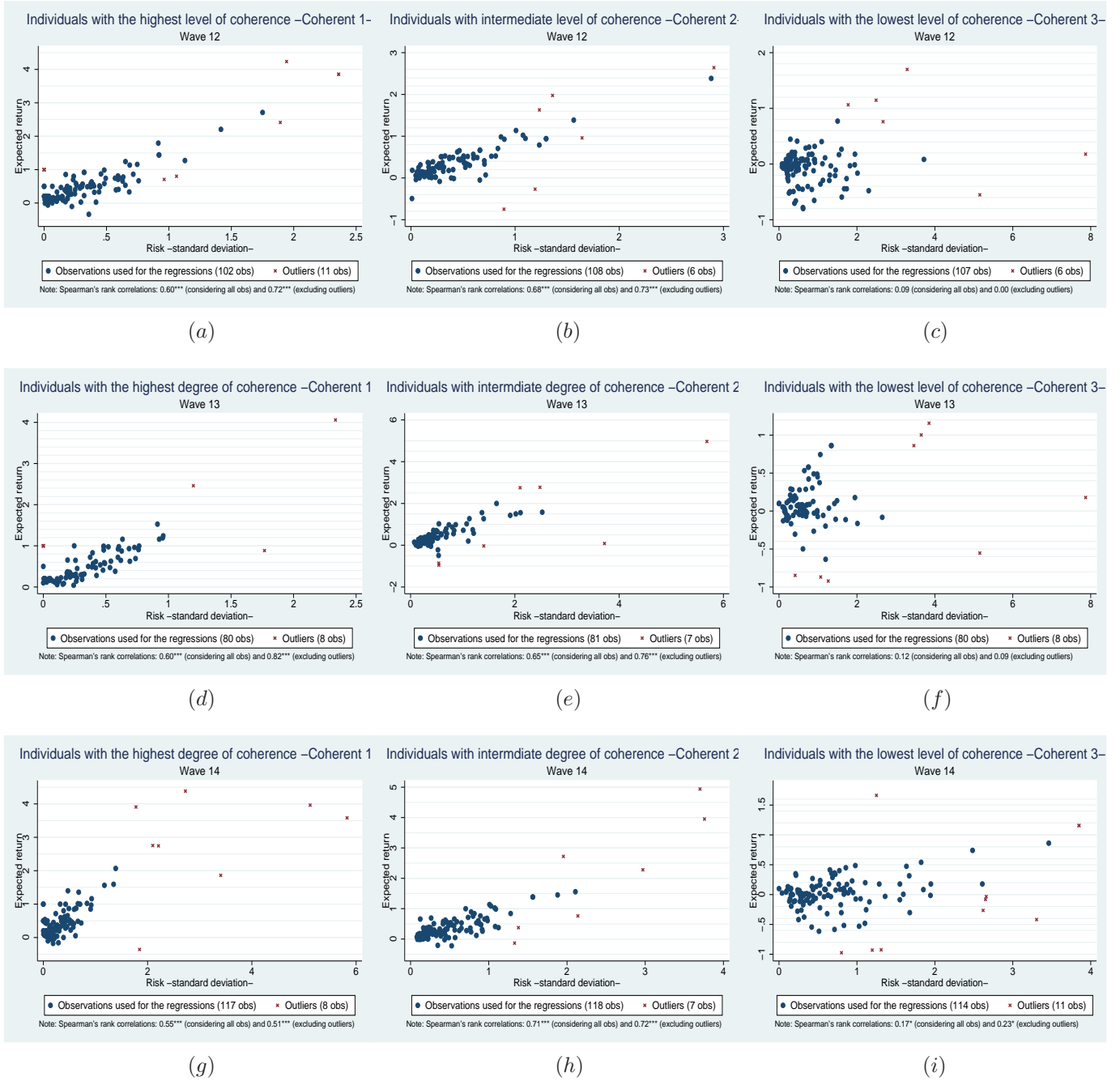
Figure 2: Plot of expected return ( \mu ) against risk ( \sigma ) by type of coherence and by wave

Notes: i. A small number of respondents have the parameters ( \mu, \sigma ) of their probability distribution depicted by a cross instead of a dot in each figure. These respondents correspond to those who will be excluded from the regressions in the columns of Table 4 because they are outliers (see Section 4 for more details).