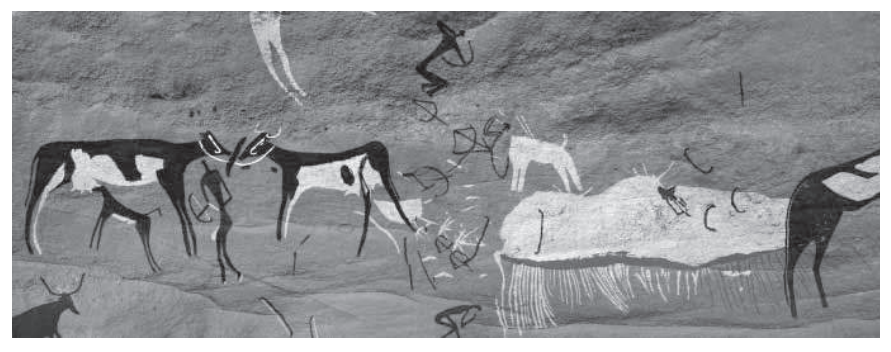
Fig. 1. Mutilated rock painting of a lion, Jebel al-Uweynât Massif, Sahara Desert, ca. 6000–4000 BCE. Such damage to early images of dangerous animals has been explained by a dread of the animation of these figures.

A recent finding corroborates this hypothesis. Line drawings by Katsushika Hokusai (Fig. 4), a leading artist of the 18th-century Ukiyo-e school, convey a vivid feeling of motion, created by the drawings of bodies in highly unstable positions. The sketches by this artist implying motion, as opposed to images devoid of it, strongly activated the motionsensitive visual cortex (including hMT+ in the human extrastriate cortex) on both sides of the brain [10].