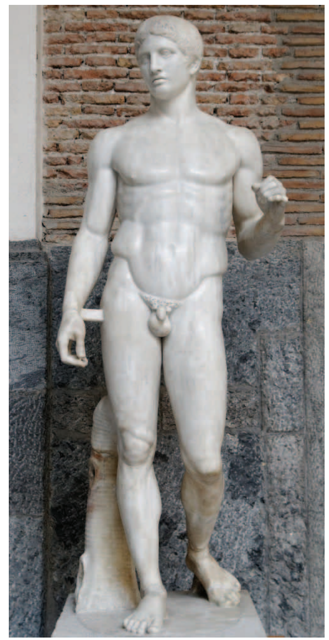
Fig. 3. Viewing the Doryphoros by Polykleitos, ca. 440 BCE, has been shown to activate motion areas in the brain.

We would not expect that rhesus macaques could comprehend deception in appearances. Images in fact aroused in them the same response as did real-life stimuli. This reaction is probably linked in part to an inappropriate MT and STS activation that "enlivens" the image. Indeed the leading edge of the propagat-