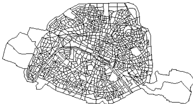
Figure 1: Paris map of IRISes

Because each wave of the CVS survey comprises about 16,000 observations, there are very few observations in each IRIS (2.3 observations per IRIS per year on average). Working at such a small scale thus prevents me from computing representative victimization rates at the IRIS level. Instead, I use variables indicating whether each individual or household has ever experienced victimization over the past two years. On the bright side, working at the IRIS level presents a major advantage: it enables me to supplement the victimization data with social, economic and demographic characteristics representative of the IRIS. Indeed, the INSEE designed the IRIS to be the primary statistical unit of the census. Most of the French statistical data sources are therefore based on this geographical unit, so that it is easy to match information at the IRIS level. Using the French population censuses from 2006 to 2009, I can enrich the CVS survey data with socio-economic and demographic characteristics of the IRIS, at the time of the survey. Since 2004, the population census has been conducted annually, in a continuous way, and each wave contains information collected over five consecutive years. 7 For instance, the 2006 census was conducted over the 2004 to 2008 period. Individuals living in municipalities of less than 10,000 inhabitants are all surveyed once over the period. For municipalities of more than 10,000 inhabitants, 8 % of the population is surveyed each year,