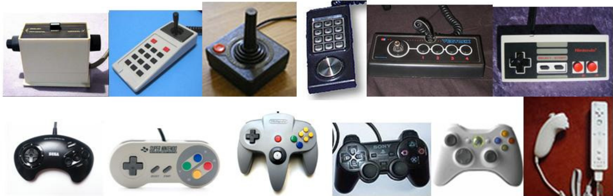
Figure 1. From left to right, top to bottom illustration in the chronological order of gamepads: Magnavox Odyssey, Radofin, Atari 2600, Intellivision, Vectrex, NES, Mega drive, Super NES, N64, Ps2, Xbox 360, Wii.