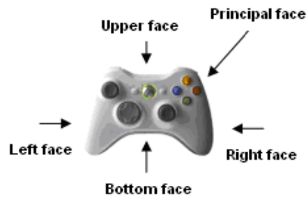
Figure 2. The different faces considered for a game controller like the Xbox 360.

To facilitate this analysis, the gamepad photographs were oriented according to their different faces (see Figure 2). The game controller is examined in the same direction as we are supposed hold it to play. The main face is the one that we see in totality when we play. Only the bottom facade of the gamepad could not be analysed. In fact, the left and right faces were often called simply left and right sides. Then, we asked for confirmation that it was indeed the left face and not the left side of the main face. The person questioned could also point his finger to what was identified, which limited discussions and ambiguities. To help people to name the elements and forms, we had already listed some (rectangle, circle, triangle, cross, croissant, pushbutton, trigger button, cable, axial symmetry, etc.).