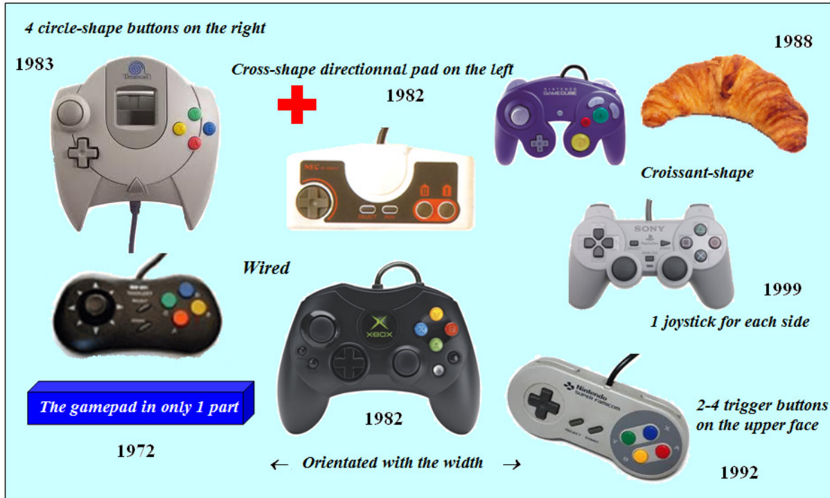
Figure 4. Prototype of what could have been a routine board feasible at the end of 2001 on the design of a console gamepad.

limited context of the gamepad design, the Vectrex gamepad provides 55% of new features compared to previous game controllers. Similarly, the gamepad of the Nintendo Wii brings 60% of changes. We can therefore make the assumption, to be checked later, that the multi-criteria innovations with 50% to 60% of changes for this type of product (as long as it does not change the size) may be accepted. From creative competitive intelligence using a routine signal monitoring, we are now able to show how a product deviates from the others and thus can promptly report this one as a potential carrier of a large number of new ideas.