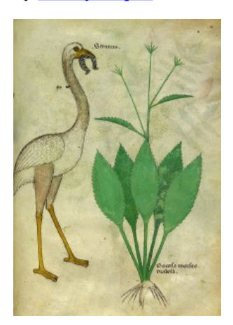
Tractatus de Herbis. 15th century. London, British Library, Ms Sloane 4016, f. 96.

October 5, 2013 By <u>Thierry Buquet</u>