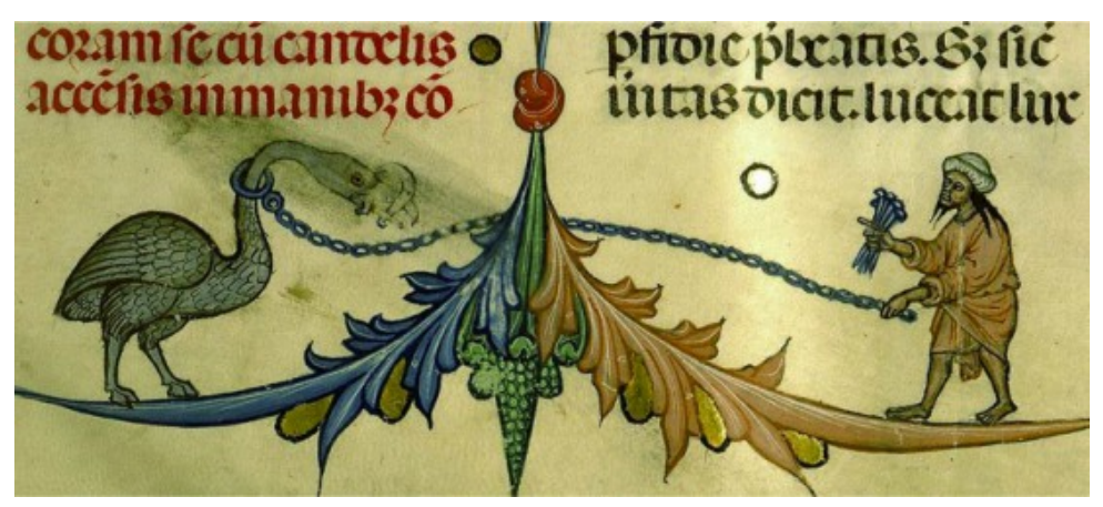
Arabic keeper with ostrich. Guillaume Durand's Pontificalis, ca. 1357. Paris, Bibliothèque Sainte-Geneviève, Ms 143, f. 12.