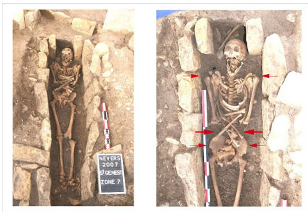
Fig. 9 – Nevers, Notre-Dame Abbey, burial 39. Left, overview; right, details of the upper half of the grave. The arrows locate the bilateral strain probably related to the presence of a very tight funerary covering.

This primary and individual grave, consisting of a coffin made of durable material, presents a narrowing at head level. Large limestone slabs were placed over the body for covering. The individual, an adult male, lies on his back, arms bent, hands on the front of the pelvic region, lower limbs extended. The bilateral strain exerted from the shoulders down to the pelvis brings the long bones of the limbs closer to the sagittal axis of the body, causes a marked displacement of the anterior sections of the right ribs toward the left side of the rib cage and the forward projection of the lower lumbar vertebrae and sacrum. 4 As the overall bone arrangement suggests, decomposition likely occurred in an empty space. This and the remotely visible strain of the chest walls, both left and right, though with a bigger space on the left side, hint at the existence of a funerary covering. Moreover, the narrow space occupied by the trunk and pelvic girdle may advance this hypothesis by suggesting the existence of a shroud tightly wrapped around the body and perhaps a holding, closing and/or tying system at waist level. This may explain the disarticulation of the elbows, the increased obliqueness of the humerus position, the forward projection of the lower vertebrae and sacrum following the coming together of the posterior sections of hip bones.