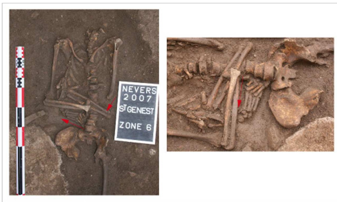
Fig.8 – Nevers, Notre-Dame Abbey, burial 107. Left, overhead view. Right, details of trunk. The arrows point to the downward displacement of the proximal end of the left forearm bones and the outward slippage of the right hand bones

This is the primary and individual burial of an adult woman. The subject rests on her back, upper limbs bent at right angles and lower limbs extended. The excavation limits of the pit are not visible and the grave was subsequently recut by a column due to the construction of a sacristy, causing the disappearance of the right lower limb. Along the left side we note a wall effect that maintains the humerus and hip bone in primary position, but the most striking observation concerns the lower slippage of the proximal section of the left forearm and the lateral displacement of the right hand. This movement cannot have occurred prior to the dislocation of joints between the hand's bones because its constituent elements retained their attachments. Although it is not possible to place this shift accurately in the decomposition timeline of the corpse, there is reason to think that a device similar to a sleeve worked to guide the hand along the forearm. Also, because material is conducive to the absorption of bodily fluids and the hand is generally poorly fleshy, we can assume mummification of the hand, which then might have helped to preserve joint connections. This assumption also suggests an empty space around the corpse, and thus that the deceased lay in a perishable chest.