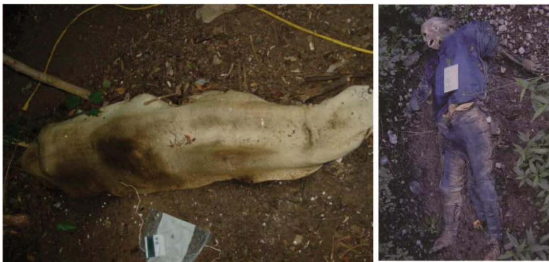
Fig.4 – photographs showing the difficulty of direct observation of corpse in wrapping and clothing context (source: DAUTARTAS 2009, fig. 16:40; MILLER 2002, fig.19: 39)

The various authors (CAHOON 1992, ALTURALYIA and LUKASEWYCZ 1999, MILLER 2002, KELLY 2006, DAUTARTAS 2009, VOSS et al. 2011) agree that clothing/wrapping goes a long way toward draining and absorbing body fluids, sometimes facilitating mummification of one or several anatomical areas of the corpse (fig. 6). This finding is all the more important in wrapping contexts because there are no separation areas between the various pieces and the largely widespread confinement of the corpse is instrumental in draining body fluids.