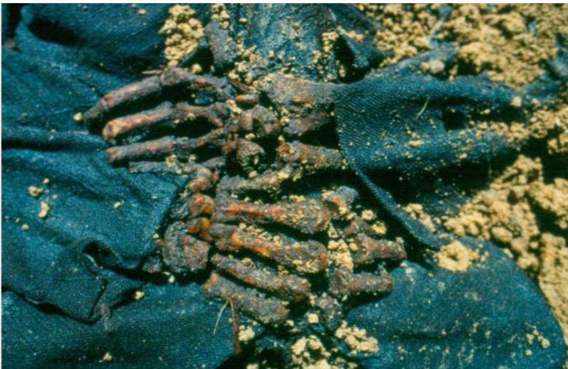
Fig. 7- example of preservation of joint connections of hands placed on the front of the abdomen of a clothed individual (Source: GEMMERICH 1999, fig. 12:22)