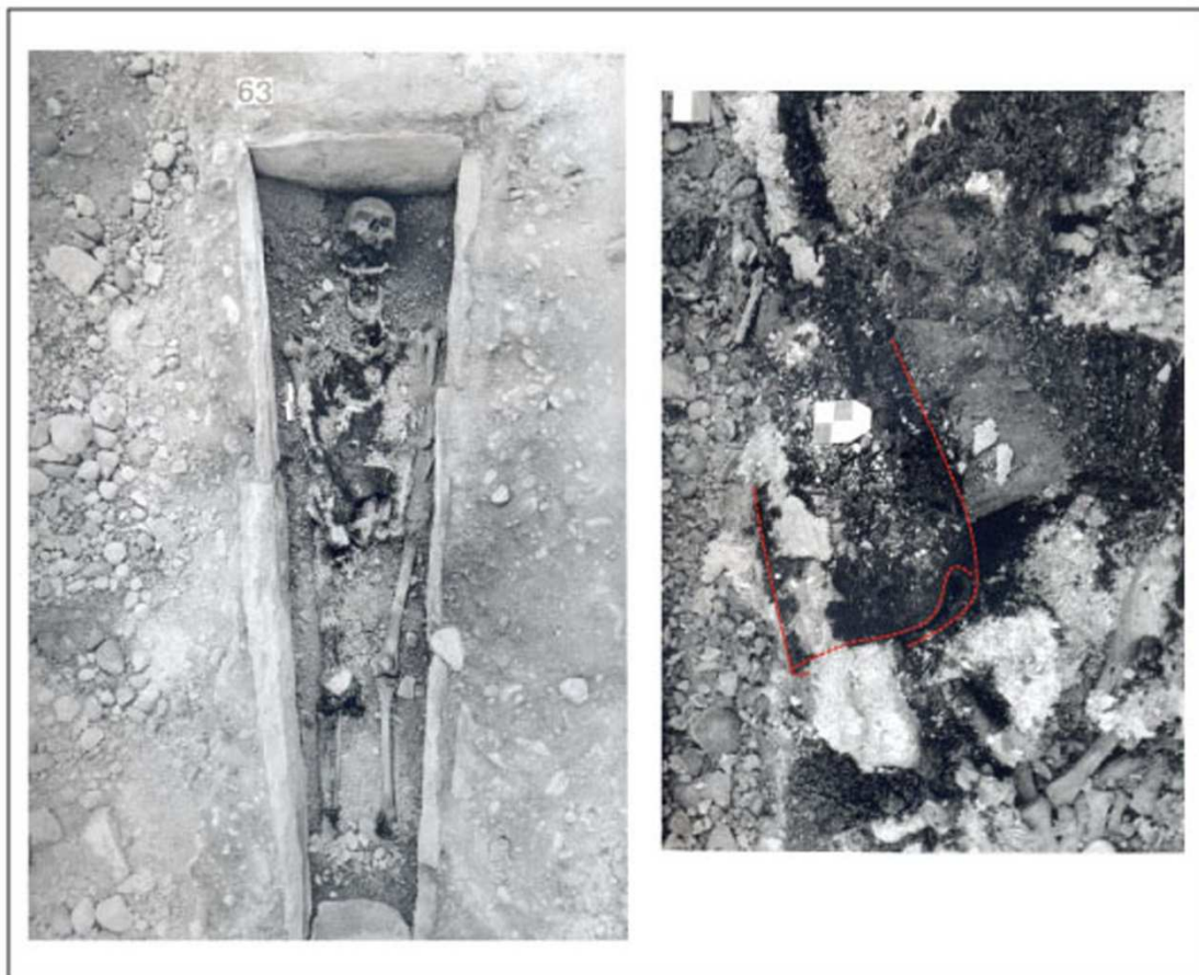
Fig. 10 - Crotenay, burial 63 :left, overview, right detail of the right upper limb with the mineralized fragments of a sleeve.

This is the primary and individual grave of a man lying in a trapeze-shaped coffin sealed up by horizontally placed flagstones. The spaces in between these were repointed with mortar. Sedimentation solely occurred through percolation, more specifically on each side of the proximal end of the cavity. In this case, it is not anthropological arguments that allow us to propose the hypothesis of a textile covering but the preservation of the textile remains per se. These are particularly located around the right forearm (sleeve) over the upper section of the torso's right side and around the distal extremity of each tibia-fibula pair. In this particular case, we have substantial evidence to argue that it is clothing made up of a top and bottom section most probably separated at the waist, though this is as accurate as we can get. For the top section, at least two types of material were used; the outside piece consists of thick fibers and covers one or several pieces of much thinner material. The material used for the bottom section is similar to the outside textile of the body's top section. The bottom of the legs was adorned or reinforced with a strip of thick material placed perpendicularly to the main axis of the leg.