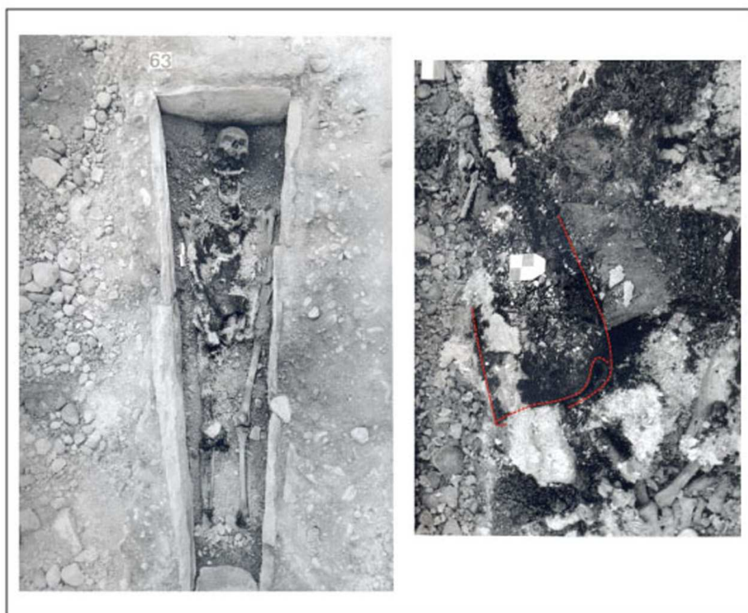
Fig. 10 - Crotenay, burial 63 :left, overview, right detail of the right upper limb with the mineralized fragments of a sleeve.

This is the primary and individual grave of a man lying in a trapeze-shaped coffin sealed up by horizontally placed flagstones. The spaces in between these were repointed with mortar. Sedimentation solely occurred through percolation, more specifically on each side of the proximal end of the cavity. In this case, it is not anthropological arguments that allow us to propose the hypothesis of a textile covering but the preservation of the textile remains per se. These are particularly located around the right forearm (sleeve) over the upper section of the torso's right side and around the distal extremity of each tibia-fibula pair. In this particular case, we have substantial evidence to argue that it is clothing made up of a top and bottom section most probably separated at the waist, though this is as accurate as we can get. For the top section, at least two types of material were used; the outside piece consists of thick fibers and covers one or several pieces of much thinner material. The material used for the bottom section is similar to the outside textile of the body's top section. The bottom of the legs was adorned or reinforced with a strip of thick material placed perpendicularly to the main axis of the leg.