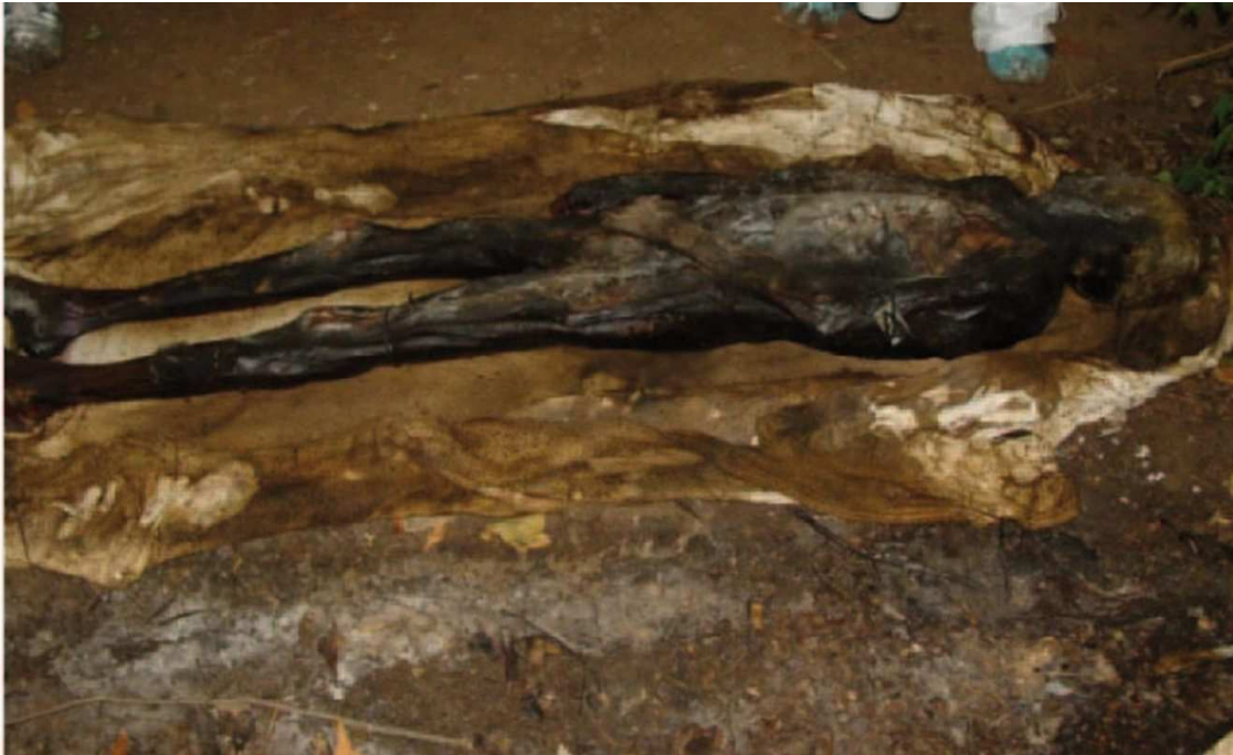
Fig. 6 – example of corpse wrapped in cotton blanket for 30 days. Note that mummification stretches across the corpse and that the blanket absorbed the majority of body fluids