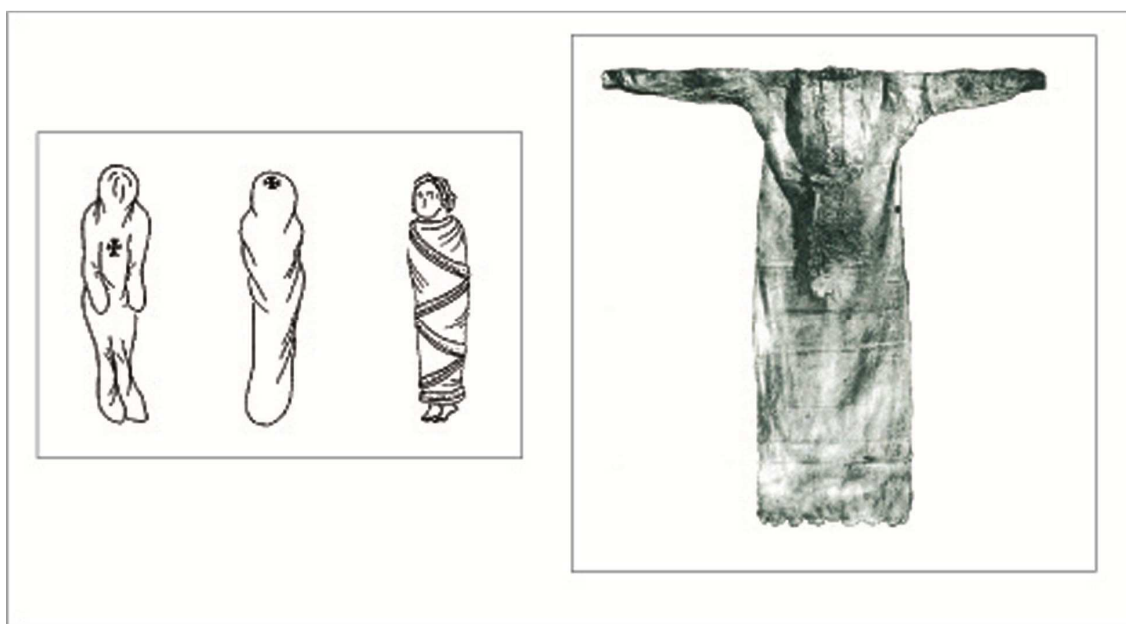
Fig.3 – examples of shrouds. Left, iconographic representations, right, shroud unearthed in archaeological context.

Wrapping generates the confinement of the entire body, which raises the question, from a forensic point of view, of insects' access to the dead body, draining of body fluids etc., and thus more broadly, progress of the corpse during decomposition in these conditions.