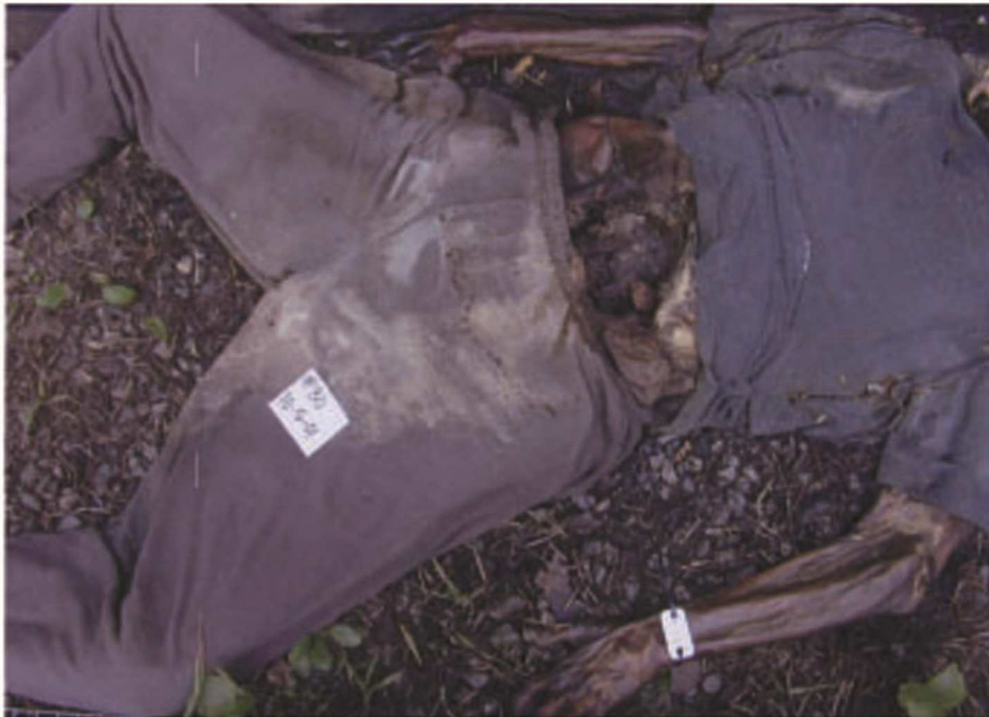
Fig. 2 – example of rupture at abdominal muscle level due to presence of clothing (MILLER 2002, fig. 30, p. 49)