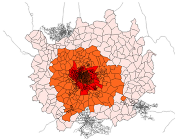
Figure 1. Small retailers' accessibility in Lyon's conurbation

We observe that for small retailers, the quartile spatial distribution of zones in terms of accessibility shows well that Lyon has a very attractive city center: most accessible retailing activities are located in the inner center and the main city, and zones are less accessible as well as distance to city barycenter increases.