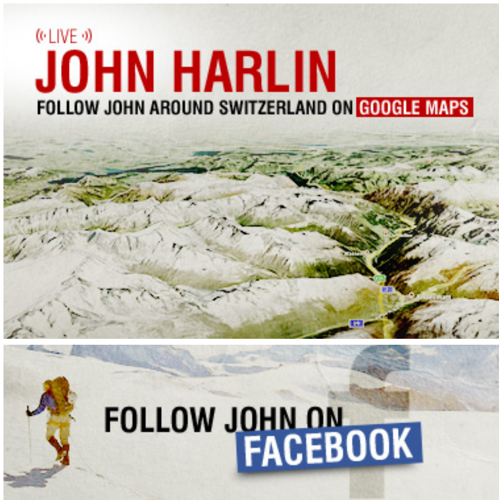
Figure 4. On the main page of the Swissinfo.ch site, “High Adventure on Switzerland’s Borders”, an image promoting the coverage of the epic journey by J. Harlin on Face Book