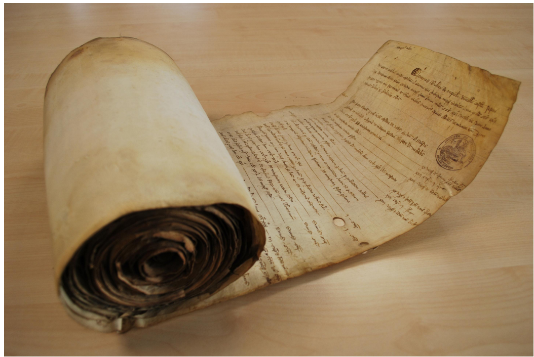
Figure 1. A fourteenth-century account roll, from the Archives départementales de la Haute-Savoie, SA 17755.

Their form was specified in the 1389 statutes of the Chamber of Accounts, although it had been in use since their origin. The page setting, generally neat, was relatively stable from the beginning until the end of the fifteenth century. The earlier accounts have a more compact setting, with rubrics in the margins to mark the various types of receipts and the expenses, and all the items within a single rubric being written in a block paragraph: this is the case in the account edited here. Rules were lined on the parchment to guide the scribe, and some are still visible. The total amount (summa) of income for each rubric is summed up in a separate paragraph at the bottom of each rubric and generally centred. Starting from the fourteenth century, the page layout became better spaced and more structured: a three-column layout emerged (the rubric titles on the left, the description of the items in the centre, and the sums on the right), and the beginning of each item was written on a new line instead of one after the other. A consequence of this evolution of the page layout was an increase in the length of the accounts and rolls.