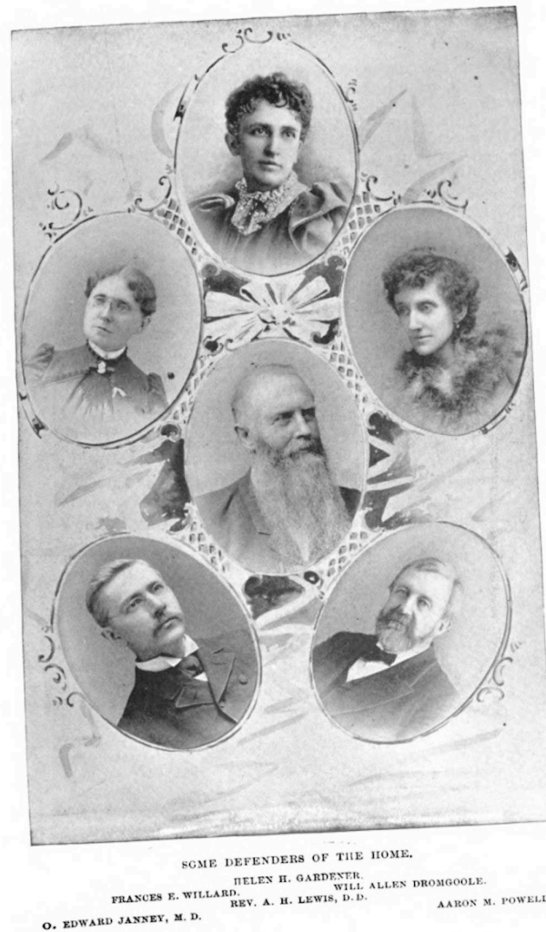
Figure 8. "Some defenders of the home"

flood their representatives with letters. 45 For all his talk about a radical and broad purification of society, a single-issue campaign finally did prove more effective - by the end of 1895, the age of consent was raised in six states. 46