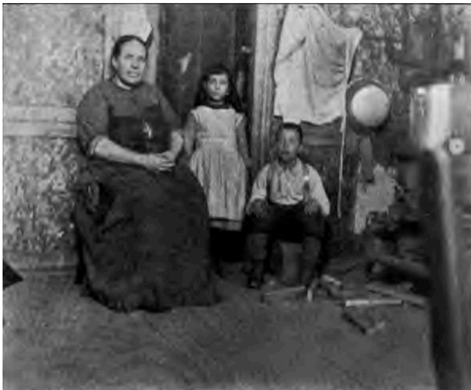
Figure 6. An example of "typical" poverty of the time: "widow and two children in under-ground tenement"

Like Jacob Riis in New York, Flower studied poverty in Boston and used the power of photography to document the life of the underprivileged in a book entitled Civilization's Inferno, or, Studies in the Social Cellar . 33 His study - part sociological survey based on fieldwork and statistical analysis, part mise en scène of poverty and a modern rewriting of Dante's circles of hell to shock readers into action - revealed the gendered nature of urban poverty at the time. His description of the case of a widow and two children working in an underground tenement was, for him, "typical" of problems at the time (cf. figure 6). 34 Flower, like many middle-class reformers, was shocked by the discovery of women's poverty and the dangers it posed to their purity. For Flower, the written word failed to describe the "social cellar" - only "a few glimpses of the horrors of the abyss" could be caught. 35 The word "abyss" and the darkness metaphor evoke all the unspeakable dark mysteries of the industrial city and the seemingly bottomless immorality it produced, the metaphor encapsulating in one vague, ominous term the various moral, religious, physical, racial, gender and imperial aspects of a complex phenomenon: the inexplicable squalor in a country of abundance, female degradation, male immorality, crime, and the explicit analogy between investigators' "studies in the social cellar," and the exploration, in the wake of Stanley, of the "Dark Continent" and its savagery. 36