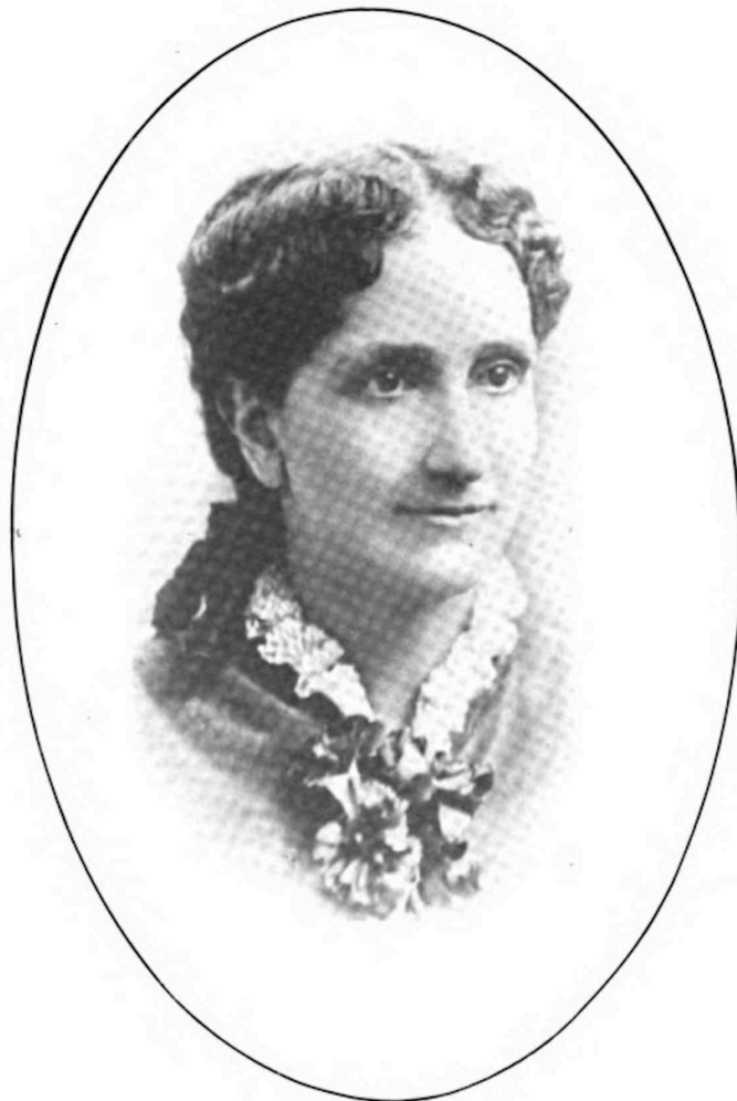
MRS. MARY BAKER EDDY

From a photograph taken while living in Lynn