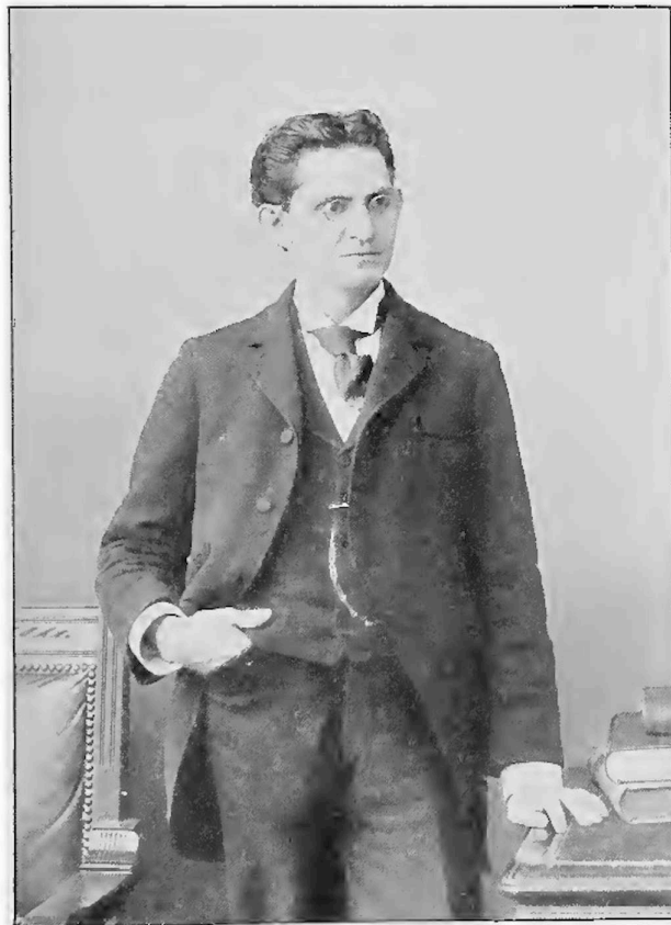
B. O. FLOWER.