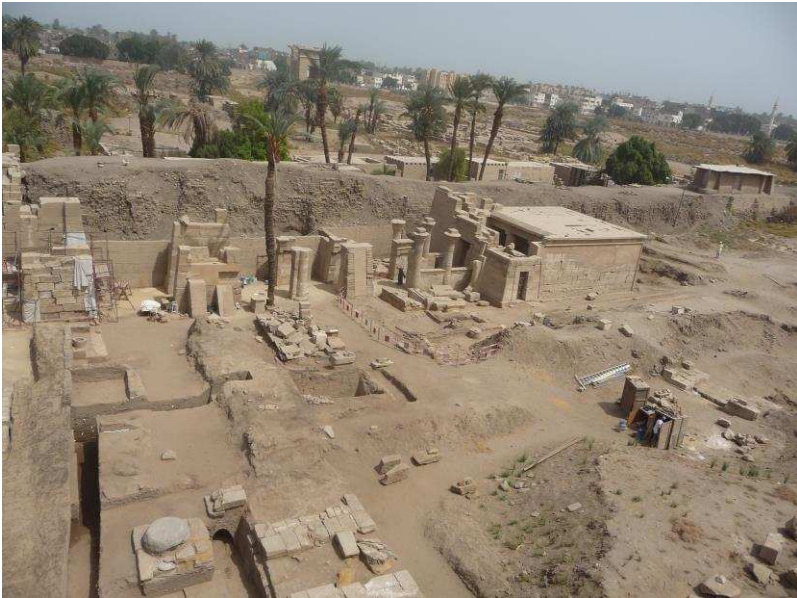
Fig. 28-2: General view of the Temple of Ptah.

The Thirtieth Dynasty precinct wall was extended to enclose the temple of Ptah, and so we have to take into account that its northern annexes were destroyed during this enlargement of the temenos. The subsequent architectural works on the axis of the temple have been less substantial. A new gate with the name of Ptolemy VI was built along the route between the temple of Amun and the northern sanctuaries of Karnak. The last building stage seems to be from the reign of Ptolemy XII who added an intermediate and isolated door without lintel.