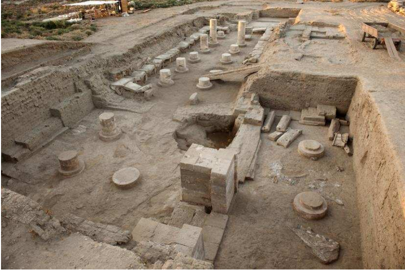
Fig. 28-3: General view of the Treasury of Shabaqo in 2011.

rooms continued west of the two already discovered and that maybe another row was situated on the northern side.