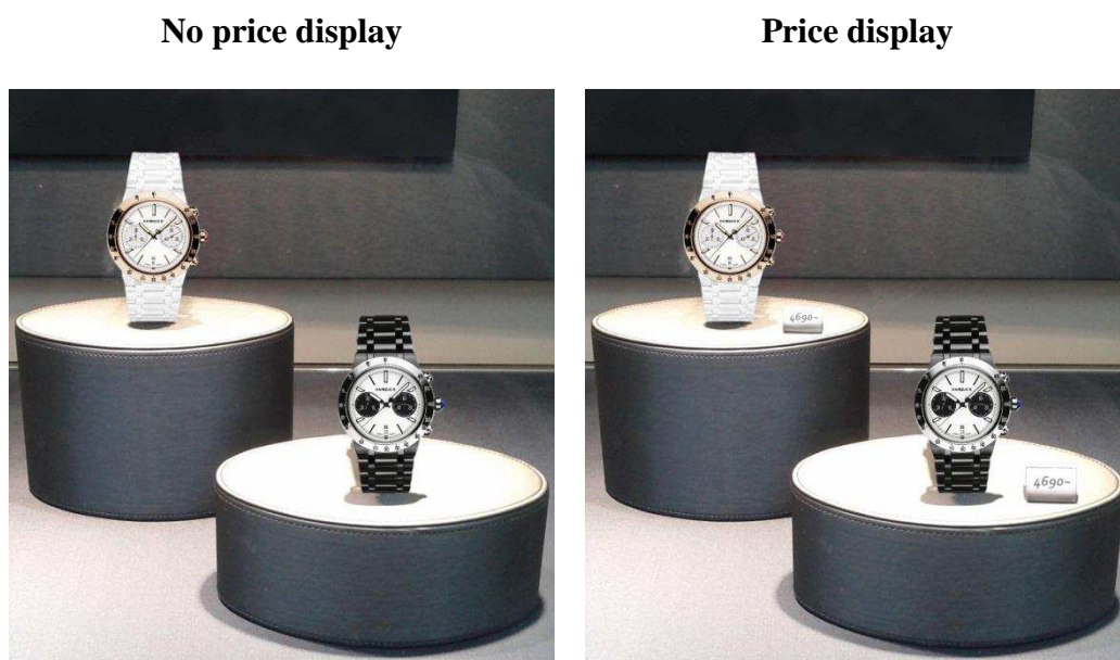
Figure 1. Study 1: experimental stimuli

We chose a fictitious brand, in line with previous studies (e.g., DelVecchio and Puligadda, 2012), to avoid any effects of prior brand familiarity. To enforce realism, the cover story explicitly explained that brand X is one of the watchmakers of the famous place Vendôme, but that its real name could not be revealed for confidentiality reasons. Manipulation check confirmed that brand X was not perceived as a highly luxurious brand (i.e., perceived luxury of 5.63 out of 7 on a Likert scale).