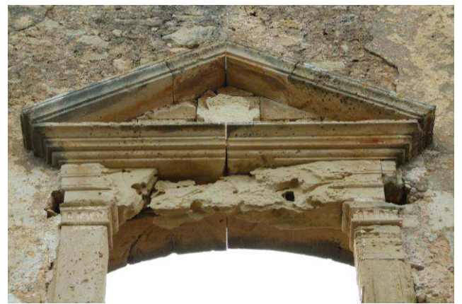
Fig. 4. The tympanum of the main door at the first floor in a photograph of 2013.

The building has got a ground floor, eventually used as a warehouse, and a residence at the upper floor ( piano nobile ): both of them are organized according to three spans ( ab , cd and ef ). At the ground floor (Fig. 5), spatial distribution of the