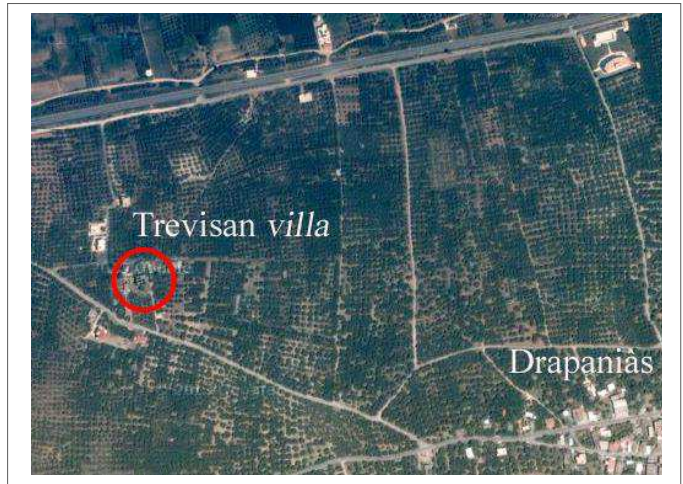
Fig. 1. Aerial photograph with indication of Drapaniàs and Trevisan villa .

The Trevisan villa is in the locality of Travasianà 14 , a few distance from the small village of Drapaniàs, east of Kissamos (Fig. 1). Unfortunately, Venetian written sources about Chania region (from which Kissamos area depended) were lost, and the only source to learn the architectural typology and the building techniques is the building itself.