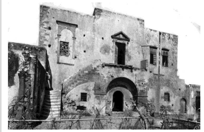
Fig. 2. The eastern façade of the villa in a photograph of 1900-1902 from [11], photographic collection n. 424.

inhabited until the beginning of the 20th century (Fig. 2). It is yet a private property, but two decrees declared it as historical monument in 1965. Thirty years ago, the 28th Ephorate for Byzantine and Post-Byzantine Antiquities carried out an architectural survey, but the current building is very different from that measured (Fig. 3). For this reason, our first aim was to update available information, correcting the existing survey on the field.