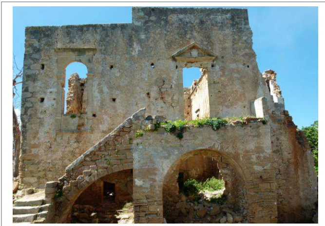
Fig. 3. The eastern façade in a photograph of 2013.