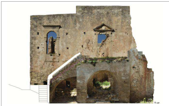
Fig. 6. The eastern front after digital image rectification with PhoToPlan.

We did not measure all the wall panels because of serious dangers of collapse and access difficulties. In particular, the perimeter walls lost their vertical arrangement and vertical cracks clearly show they are “opening up”: we measured the whole crack pattern through image rectification (Fig. 6).