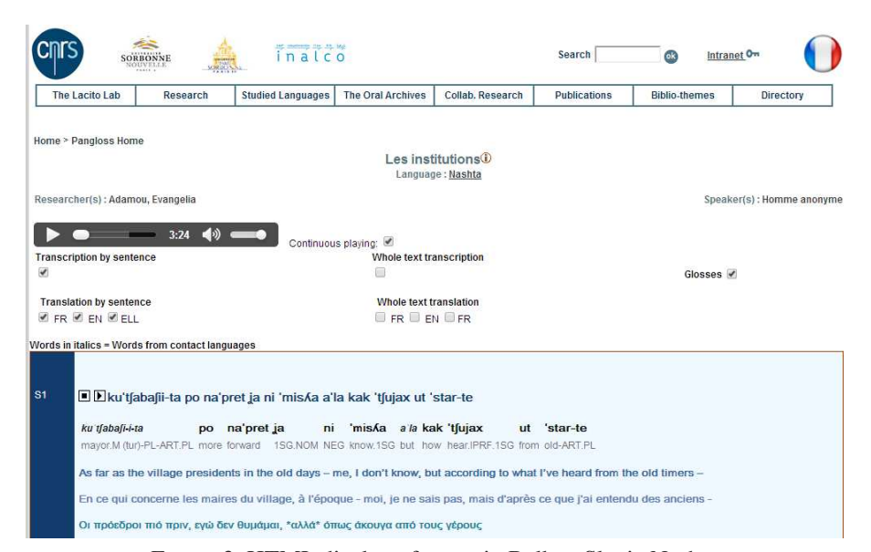
FIGURE 3. HTML display of a text in Balkan Slavic Nashta

for words and morphemes, and notes. The interface offers the option of hiding unneeded parts of the annotations. If there is more than one translation, the user can choose which one(s) he or she wishes to see. When glosses are provided in several languages, each one appears on a separate line. Figure 3 shows the HTML display generated from a document in Balkan Slavic Nashta.