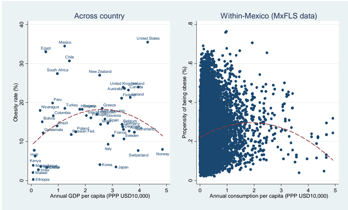
Figure 1: Obesity and Living Standards Across- and Within-country

a symbol of making one's way out of poverty while individuals in the top of the distribution may adopt Western standards regarding body mass and physical appearance.