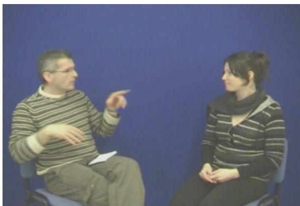
Figure 3: SP3: Center-West of France area