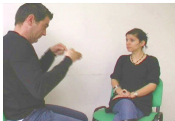
Figure 2: SP3: South of France area

Sub-project 3 aims at collecting 53 semi-directive interviews, of 90 minutes each. A 45 minute phase of guided interview on a set of pre-established topics is meant to collect newly created lexical units in a discursive context. It is followed by another 45 minute phase of metalinguistic discussions on the lexical units collected. Each interview is concluded by an informal discussion of at least 5 minutes. The panel of interviewees was devised in order to gather a representative sample of new LSF units, from all over metropolitan France, across all age brackets (from 18 to 45 years old), socio-professional settings and linguistic backgrounds. Figures 2 and 3 below show still pictures of the interviews described above.