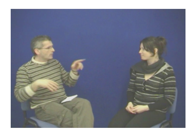
Figure 3: SP3: Center-West of France area