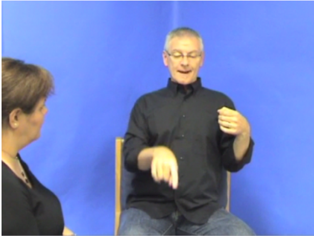
Figure 2: Pointing associated with mouthing [la] (there), (CREAGEST corpus), (Sallandre & L'Huillier, 2011)

Mouth gestures , on the other hand, can be defined as mouth features which are not associated with actual words in any given spoken language. They include motions and actions stemming from the mouth: