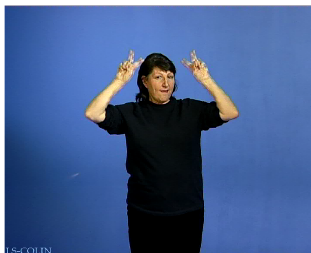
Figure 1: LU HORSE with associated mouthing [ʃəv] (LS-Colin corpus, the Horse Story), (Cuxac et. al., 2002)

It should be noted that mouthings serve essentially as non-manual visual cues associated with the manual ones. As such, they sometimes exhibit Gestalt-like properties: the actual fine-grained and complete articulation is not necessary; the most salient or conventionalized aspects of the “word” are sufficient. For example, in LSF, such mouthings will include actual French words, such as in LU CHEVAL + “cheval” (horse). 5