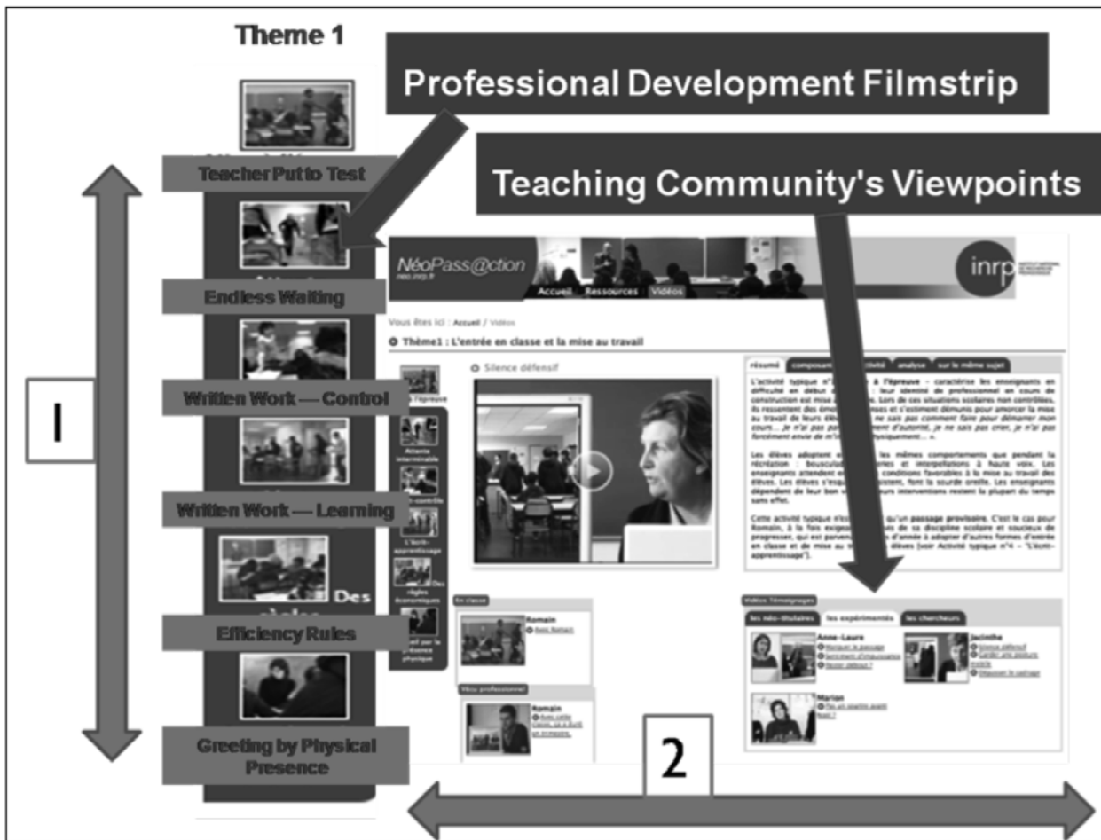
Figure 2. Dual model: (1) Transformations of the professional activity of teachers in a vertical "filmstrip". (2) On the horizontal axis, occupational learning-development routes, going from testimonies of novices to those of more experienced teachers.

arouses their curiosity and interest. These models foresee future situations and can help orient the educational trajectories of trainees by addressing their concerns and expectations as they start to teach.