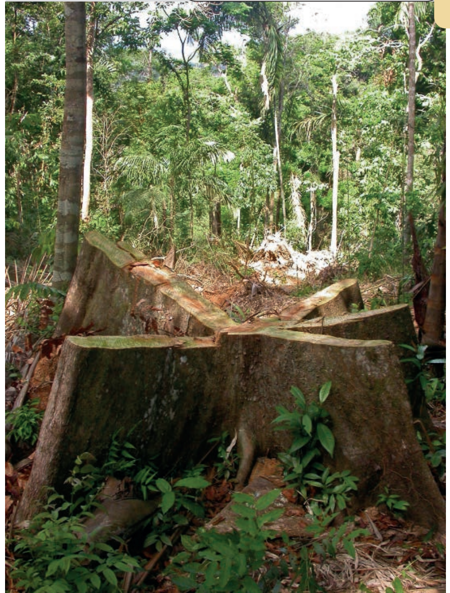
Within the remaining forest logging is done to produce wood for construction and wood charcoal.