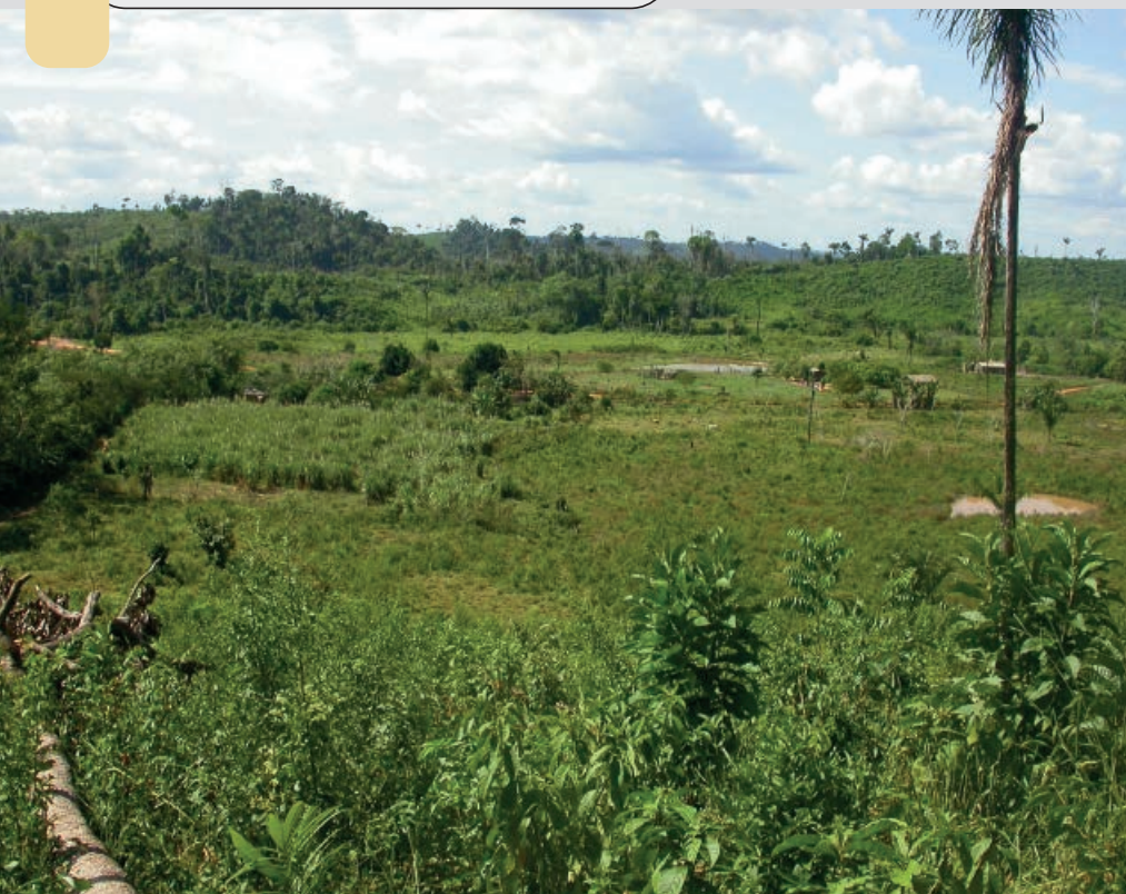
Landscape mosaic in Palmares-2. Each smallholder manages a plot of 25ha. At the first plan agricultural patchwork with fallow, sugar cane and rice is visible. On slope and remote area a degraded forest still remains.

enced a strong land-use dynamic, characterized by rapidly advancing frontiers and strong land tenure conflicts between the traditional population, settlers, large holders, mainly cattle ranchers and companies (ARNAULD DE SARTRE, 2006). Palmares-2 had initially been a fazenda but was successfully invaded by the Landless Workers Movement ( Movimento dos Trabalhadores Rurais Sem Terra or MST) in the early 1990's. After violent conflicts, in 1997 the government formally recognized the settlement of 517 families. An area of 15,850 ha was expropriated and divided between the families in regular 25 ha plots of 1,000 m by 250 m. Due to their story, three types of farmers can be identified within this population: ex garimpeiros (gold miners) who worked at the former El Dorado gold mine and stayed in the region after its closure; smallholders or sons of smallholders from the region who were waiting for another land (either bigger or located closer to a city); landless farmers living either in the region or in another region who wanted to own a land in order to produce for themselves.