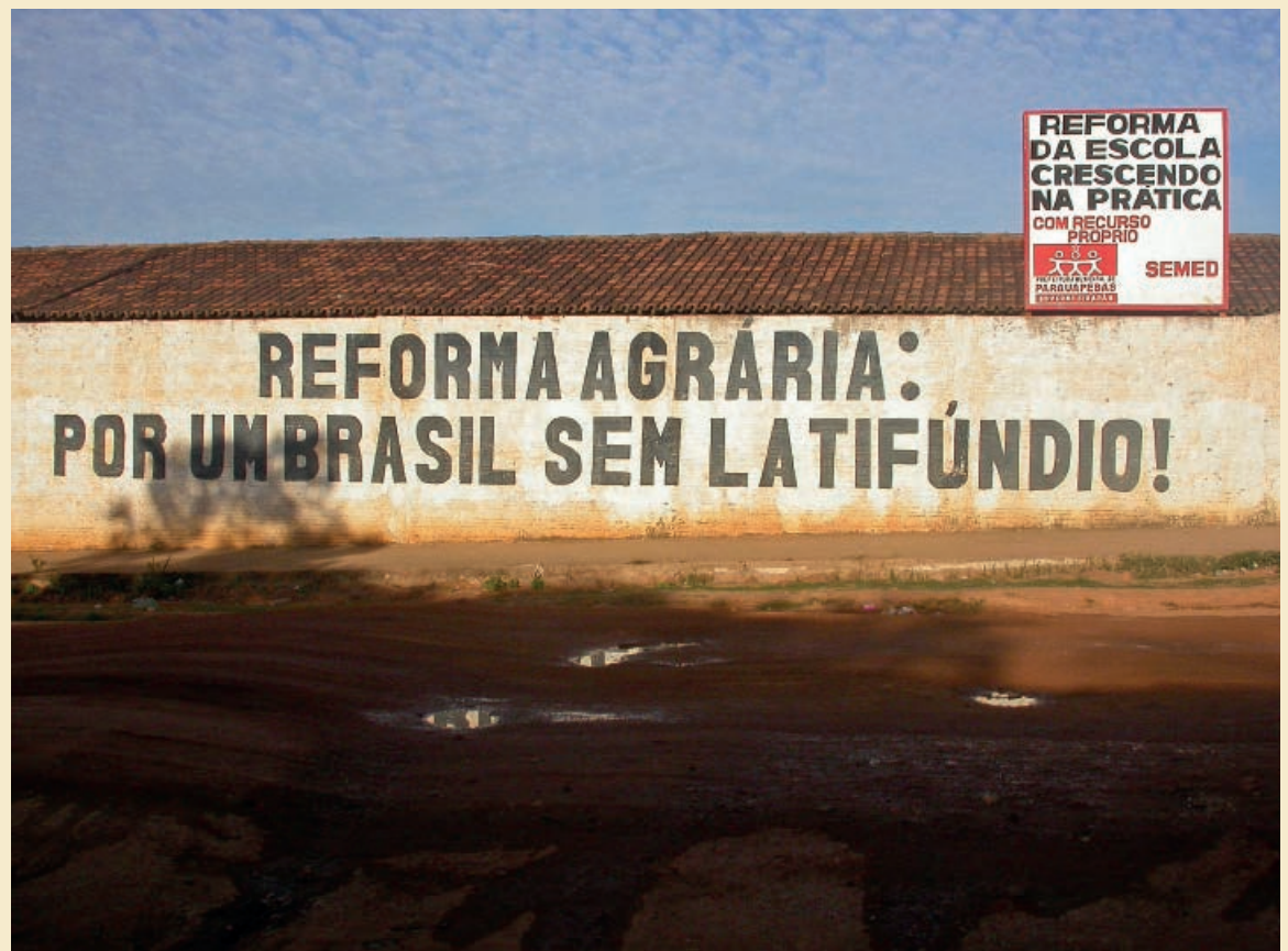
Palmares-2 is a district managed by Landless Workers Movement on an old fazenda. After the conflict in 1997 the government recognized the settlement of 517 families.

4 Université de Pau UMR SET Avenue de l'Université BP 576 64012 Pau Cedex France