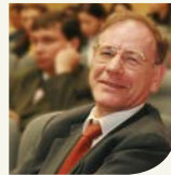
Professor at the University of Paris IV-Sorbonne ; President of the journal Population & Avenir .

The number of Americans who consider that they or their forebears 3 originally came from Europe still form a majority of the population. Classed by decreasing order, they come from: Germany, Ireland, Great Britain, Italy, and Poland, followed by France. Mexico is the most important non-European country of immigration in the U.S., with a diaspora 4 (that is, those persons residing in the U.S. who are either born in Mexico, or who are born in the U.S. of Mexican descent 5 ) which accounts for 34,000,000 people, more than 1/10th of the American population, according to the latest available figures (2011).