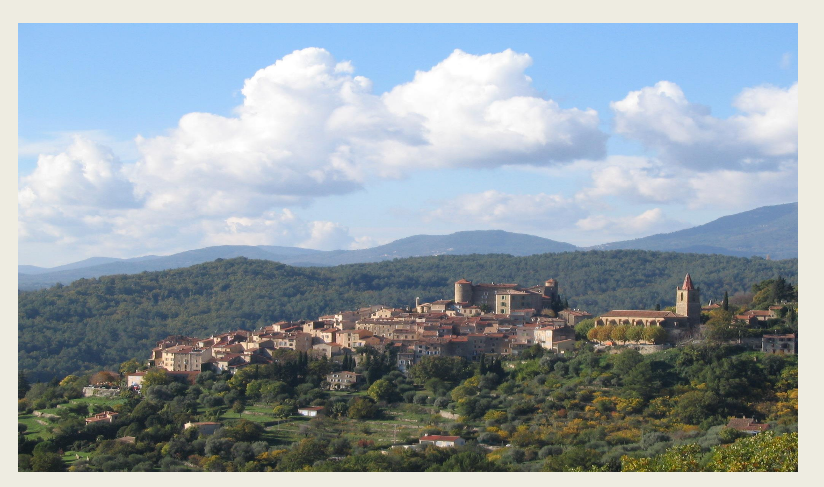
The PV solar farm (below) is located 2 km away from centre of Callian (above), uphill in the forest.

Focus on French Riviera. Position of Callian: 43° 37′ 20″ de latitude N, 06° 45′ 11″ de longitude E.