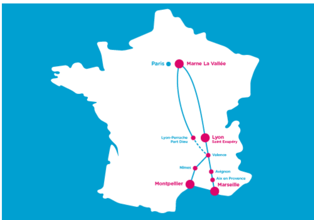
Fig. 4. Mapp of TGV Ouigo network.