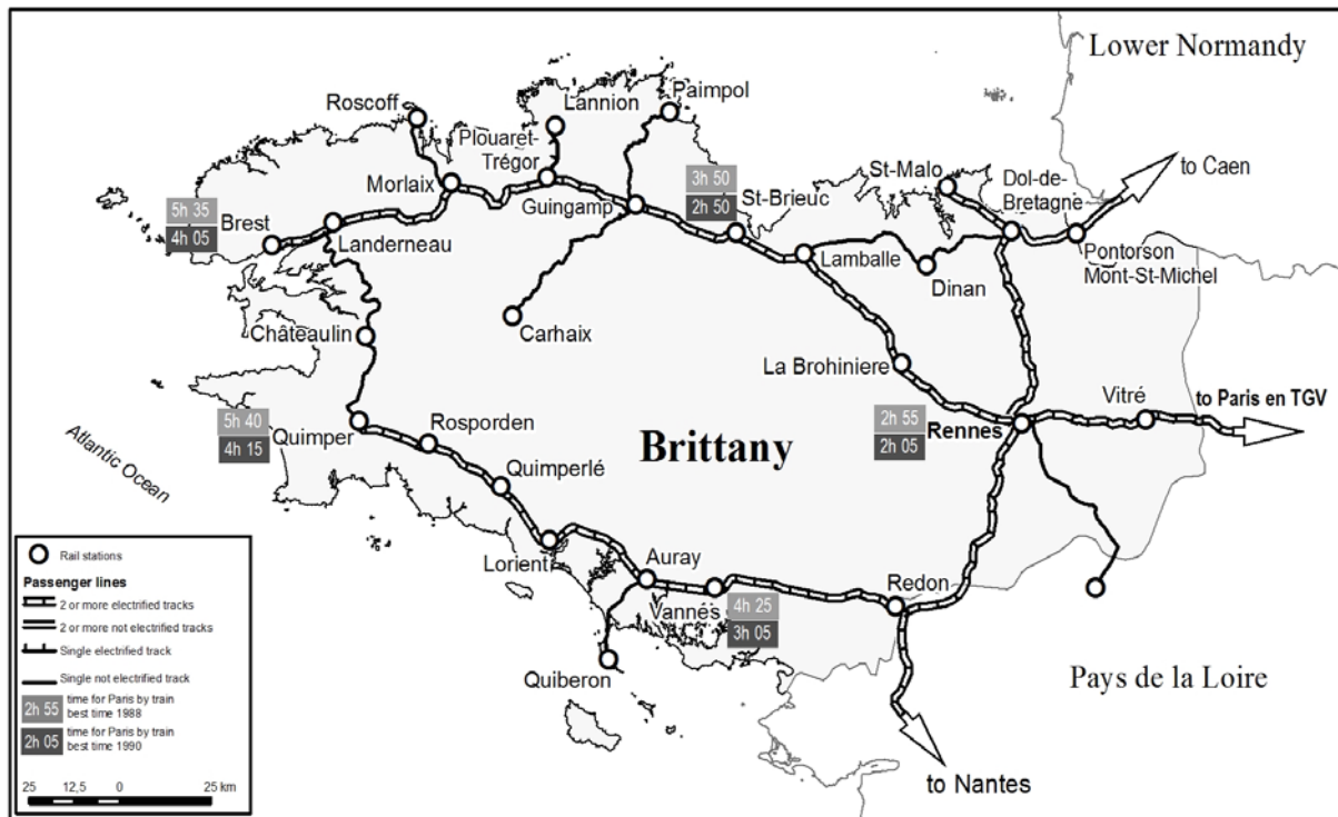
Fig. 2. The high speed diffusion benefit in some peripheral region: the case of Brittany.