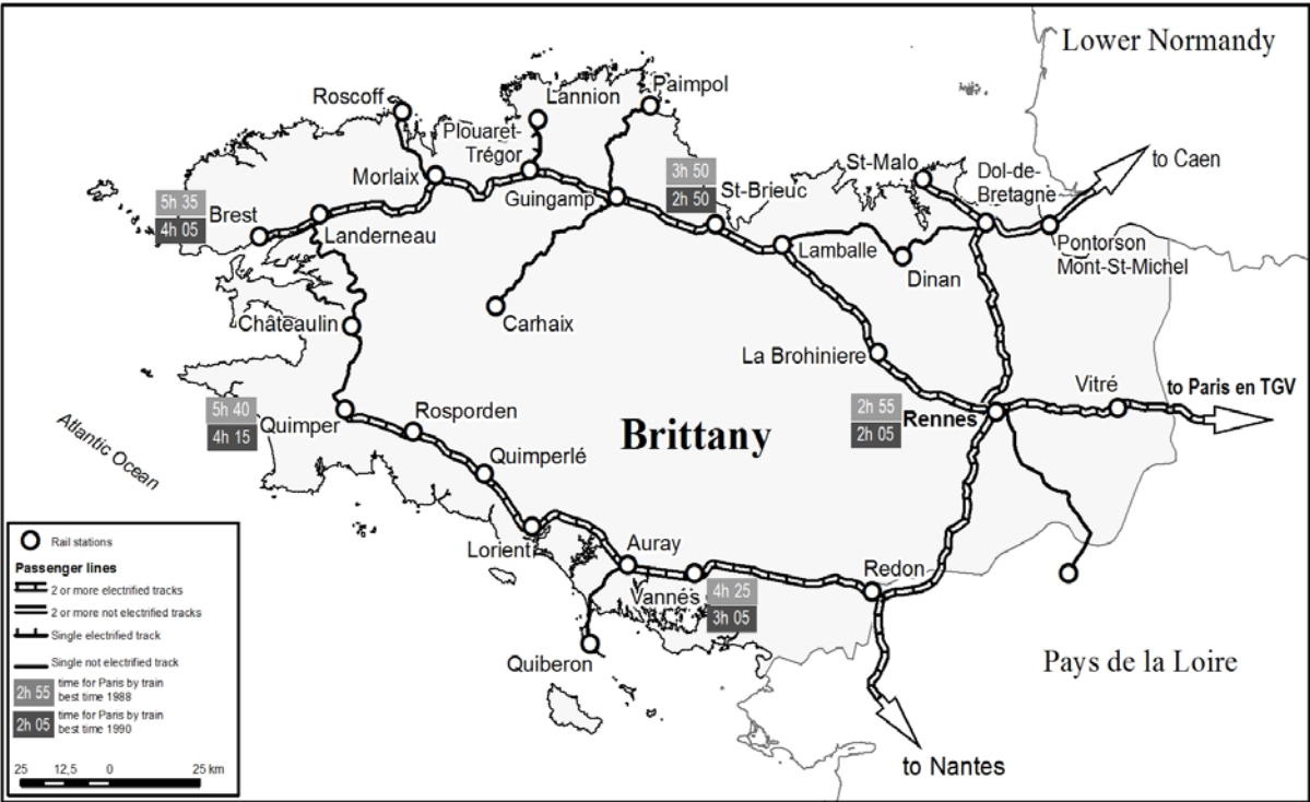
Fig. 2. The high speed diffusion benefit in some peripheral region: the case of Brittany.