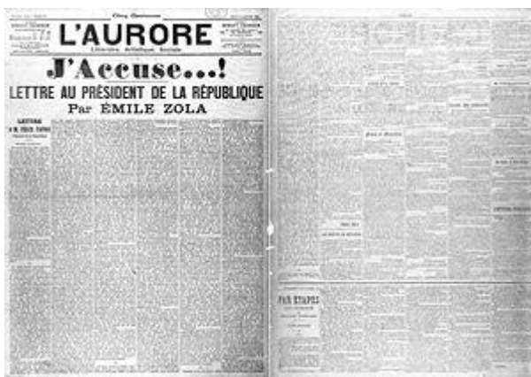
Fig. 2: Cover of the Journal “L’Aurore” of Jan. 13 th , 1898

Reasons why not: “intellectuals” is anachronistic when referring to the beginning of the 19 th century. It corresponds to no self-understanding whatsoever from the persons that are supposed to be designated by this term and hence brings little legitimacy to generalizing analyses. Furthermore, French Research would say – and it did – that intellectualism characterizes a very specific form of political engagement and cannot be applied to anyone before Zola, before “J’accuse” being printed in the front page of L’Aurore (Fig. 2). 11