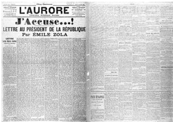
Fig. 2: Cover of the Journal “L’Aurore” of Jan. 13 th , 1898

Reasons why not: “intellectuals” is anachronistic when referring to the beginning of the 19 th century. It corresponds to no self-understanding whatsoever from the persons that are supposed to be designated by this term and hence brings little legitimacy to generalizing analyses. Furthermore, French Research would say – and it did – that intellectualism characterizes a very specific form of political engagement and cannot be applied to anyone before Zola, before “J’accuse” being printed in the front page of L'Aurore (Fig. 2). 11