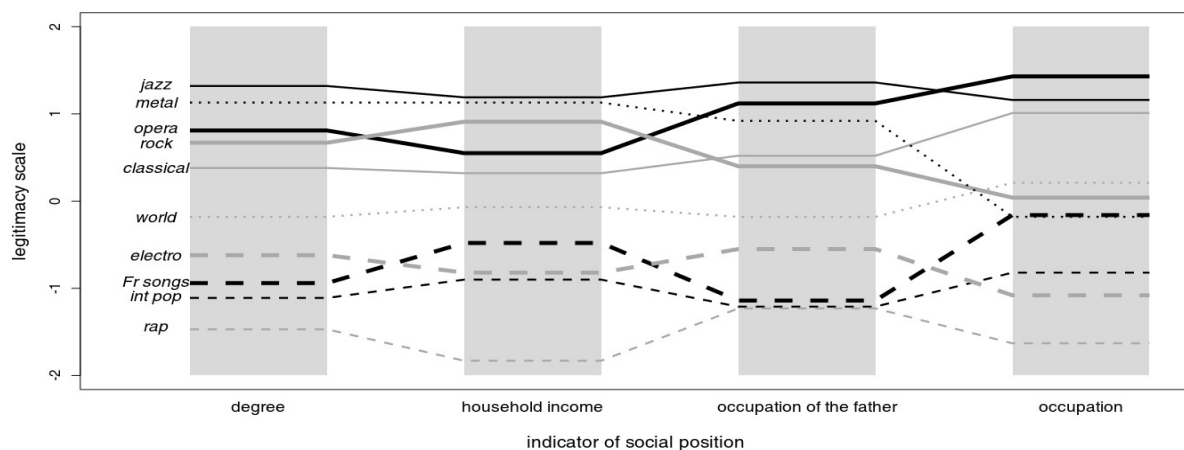
Figure 1 – Scales of musical genres listened to most often and according for different indicators of social position

Legend: int. pop = international pop; Fr. songs and pop = French songs and French pop; trad. = traditional music