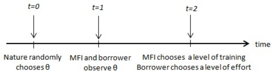
Figure 1: Timing of contracting under symmetric information

We follow the standard approach in banking modeling by assuming that the MFI is risk neutral. To simplify the model, we additionally assume that the borrower is risk neutral. 7 We analyze two information structures. In the first one, the information is perfect and symmetric: both the borrower and the MFI observe borrower type \theta . The MFI chooses h and the borrower chooses e simultaneously.