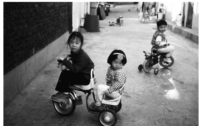
Photo 3. Singongdeok-dong in 1996. The alleyway is a playground for children.