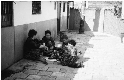
Photo 2. The semi-private use of a dead end in Singongdeok-dong's "labyrinth" of alleyways.