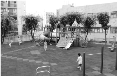
Photo 7. Sadang-dong, a classic scene in a high-rise estate: the children's playground.

ception, social content, image and subsidiary of production, the local public spaces respond to the same considerations in the conception of facilities adapted to the needs of resident populations: either purpose-built open spaces, such as children's playgrounds (photo 7), the most recently built of which sometimes include play fountains (photo 8) or closed common spaces, as in elderly care facilities. To this, one may add the various clubs frequented by women residing in the high-rise estates (clubs for sports, traditional dance, music, etc.). The maintenance of traditional practices may sometimes be observed in these new residential complexes. For example, the use of mats and small platforms placed on the edge of a playground where grandmothers sit down to look after their grandchildren. But these practices, tied to the corporeal postures of a "life lived near the ground" in domestic spaces traditionally lacking tall furniture, tend to die off with the individuals who embody them.