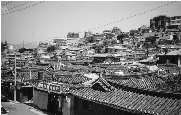
Photo 1. Singongdeok-dong renovation district ( jaegaebal guyeok 再開發區域) in 1996.

Taken in this neighborhood between 1996 and 1999, photos 2, 3, and 4 illustrate the twofold use of the alleyway as semi-private space and local public space. It is a place where women meet up to peel zucchini while exchanging news (photo 2), children ride around on tricycles—a sign that traffic is not a danger (photo 3),