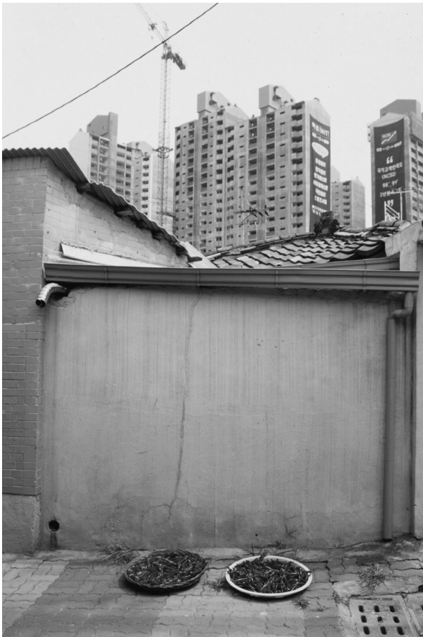
Photo 4. Red peppers dry in an alleyway that appears to be an extension of private space, Singongdeok-dong.

Here, the renovation zone pictured in photo 1 has been rebuilt by a construction branch of the Samsung conglomerate ( jaebeol 財閥).