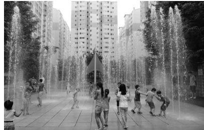
Photo 8. In Balsan-dong, recently built high-rise estates include fountains and water games, very popular among children in summer.