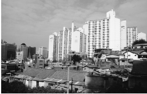
Photo 5. Singondeok-dong renovation district in 2000.

Taken in 2010, photo 6 reveals new and even more profound transformations: the red-roofed buildings of this first renovated block, which dominated under their mass the other rundown neighborhoods earmarked for renovation in 2000, now appear “dwarfed” by the very tall tower blocks constructed at the end of the decade.