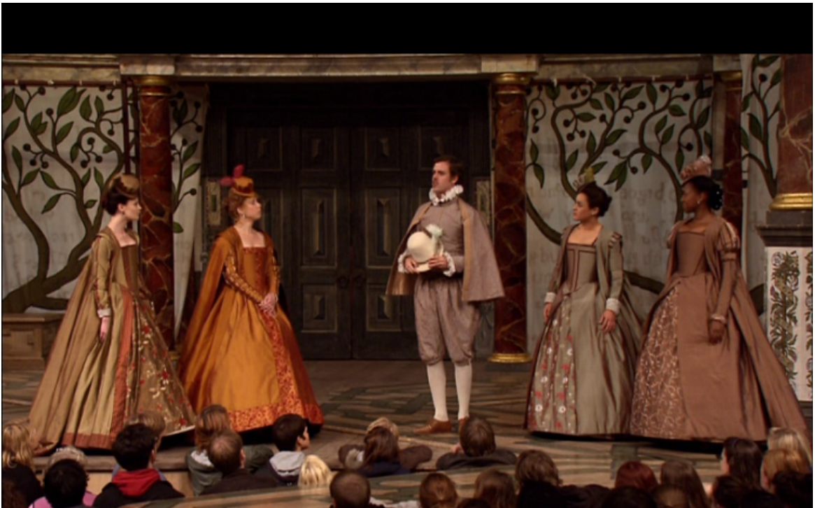
Figure 2. Globe Theatre, 2009. Screen Grab of DVD.

that is war; surveying a number of productions set in the pre-World War II 1930s, one critic has claimed, with the dubious authority of hindsight, that these productions were the result of “the gathering storm which foreboded the approach of disaster for the world, [in which] people became more susceptible to the fear of the ominous intruder who might at any moment come and snatch away their life and mirth.” 17 This interpretive hind-sight comes too easily for me. Love’s Labour’s Lost has been set in many different time periods, and surely most often in a non-specific vaguely “Renaissance” period, with doublets and hose and the usual signifiers of “Shakespeare” (fig. 2). 18