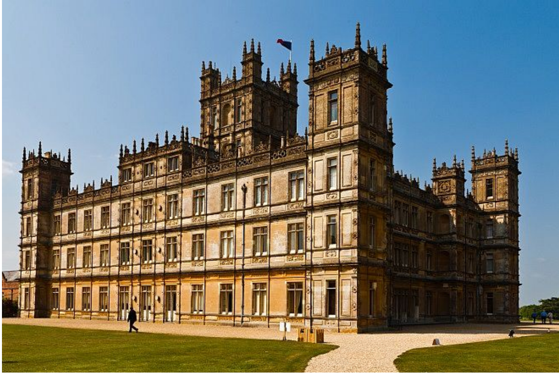
Figure 25. Highclere Castle (“Downton Abbey”).