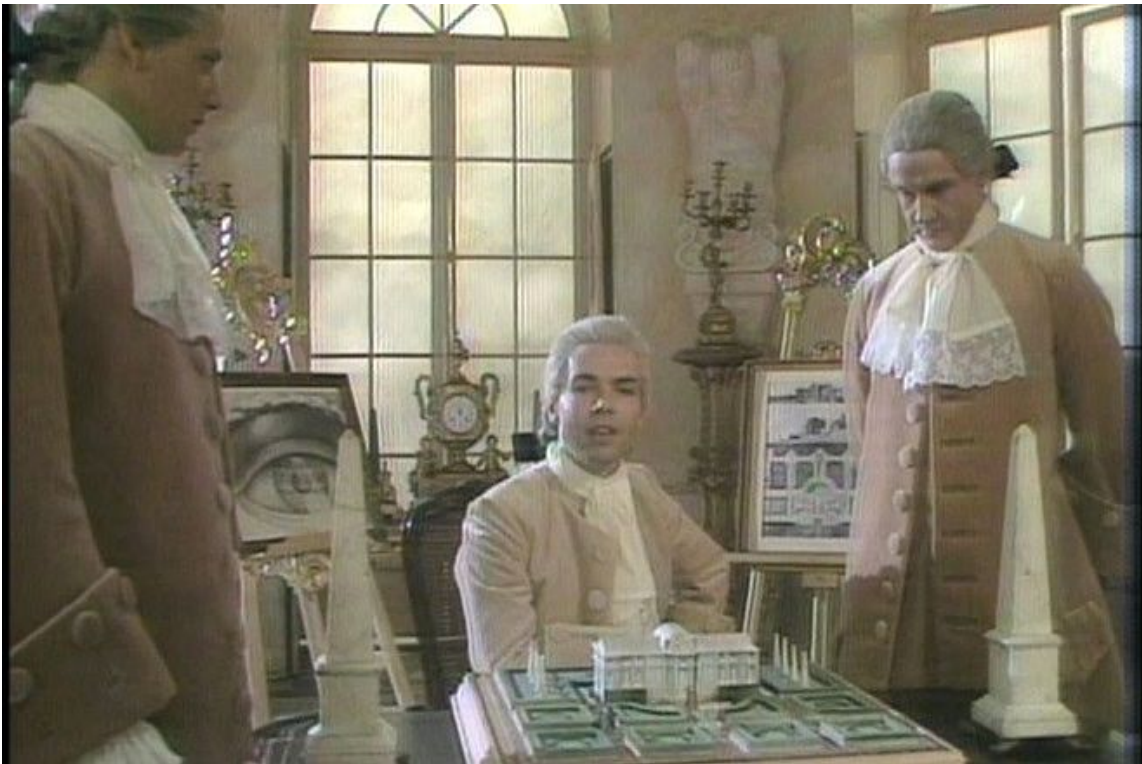
Figure 3. BBC TV, 1985, directed by Elijah Moshinsky. Screen Grab of DVD.

the world of the self-indulgent and immature lords and ladies” (fig. 3). 19