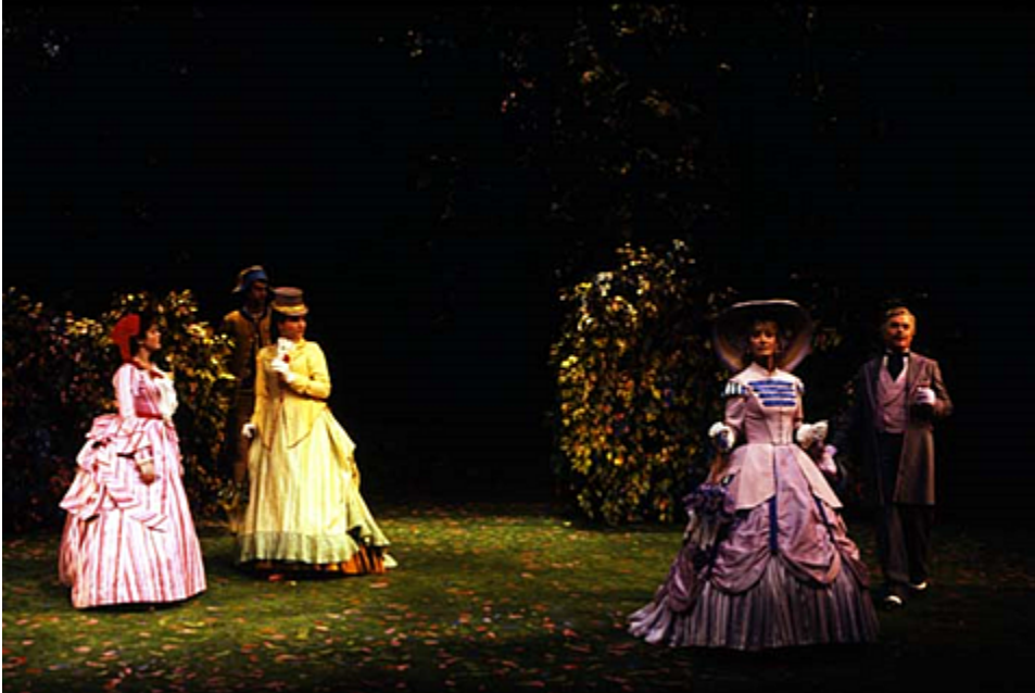
Figure 12. Royal Shakespeare Company, March 1991, Hands/O'Brien.

Donald Cooper: photographer. Rights: Donald Cooper. This image may be used for educational purposes only, any commercial use of this material requires the permission of the copyright holder.