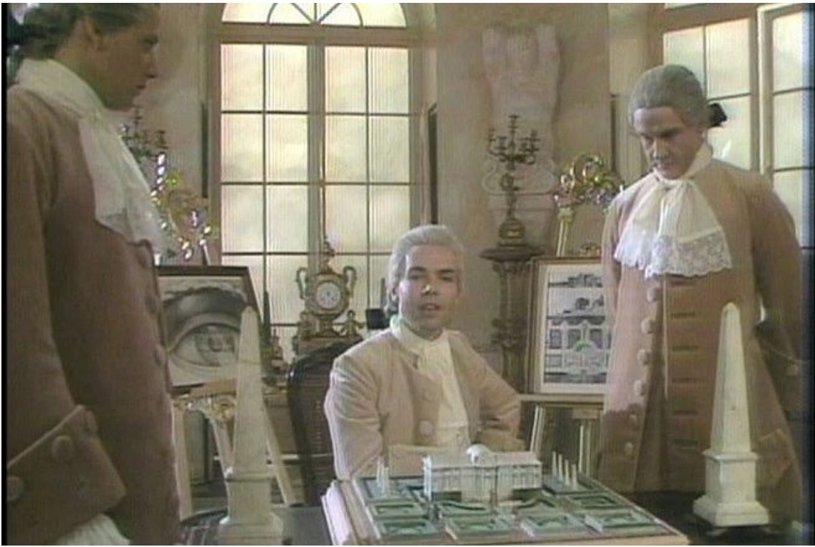
Figure 3. BBC TV, 1985, directed by Elijah Moshinsky. Screen Grab of DVD.

the world of the self-indulgent and immature lords and ladies” (fig. 3). 19