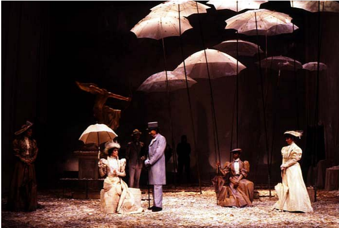
Figure 15. Royal Shakespeare Company, Kyle/Crowley, August 1985.

Donald Cooper: photographer. Rights: Donald Cooper. This image may be used for educational purposes only, any commercial use of this material requires the permission of the copyright holder.