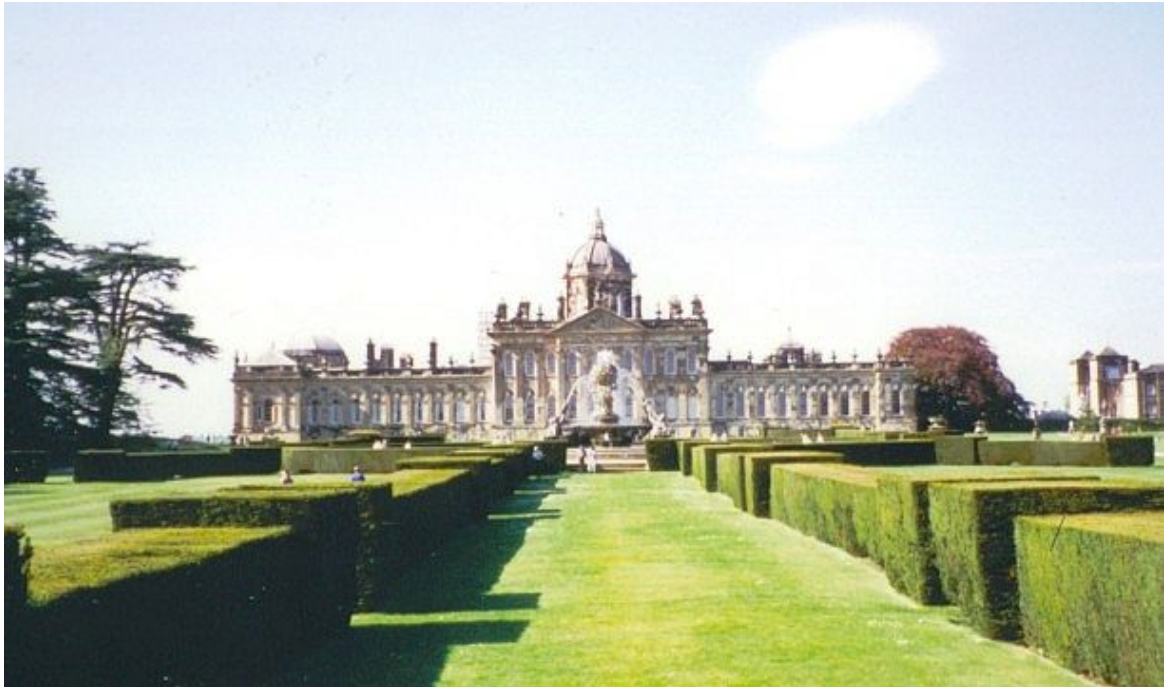
Figure 26. Castle Howard ( Brideshead Revisited ).