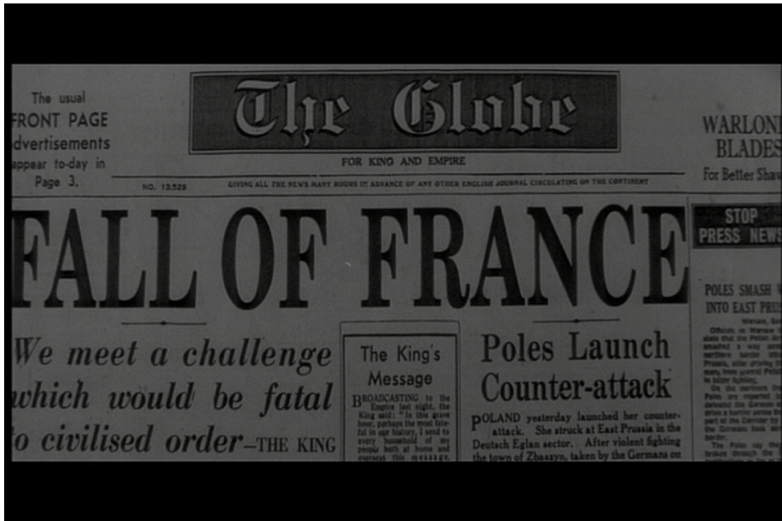
Figure 6. Kenneth Branagh, director, 2000. Screen Grab of DVD.

The happy ending, however, did not include Boyet, who had joined the Resistance and was shot and had to die in gloomy black and white. “The ‘war’ element of the film,” Russell Jackson discretely notes, “in itself was problematic.” He reports that the script “originally called for a shot where the men’s aircraft would be seen flying over the massed crosses of a First World War graveyard,” but while that scene, we can be grateful, didn’t make it into the film, the “underlying sense” of the film was always that “retreat to a ‘little academe’ was an escape from the realities of the late 1930s.” 22 The aesthetic and historiographical justifications for these choices, however, remain obscure. In an interview, Branagh said he saw the 1930s as a “last idyll in the twentieth century ... a stolen, magical, idyllic time which nevertheless had a clock ticking.” 23 Thus, as in Kilty’s production, we have contradictory ideas about the 1930s