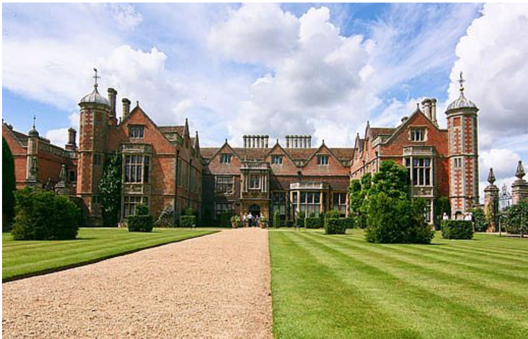
Figure 20. Charlecote Park.