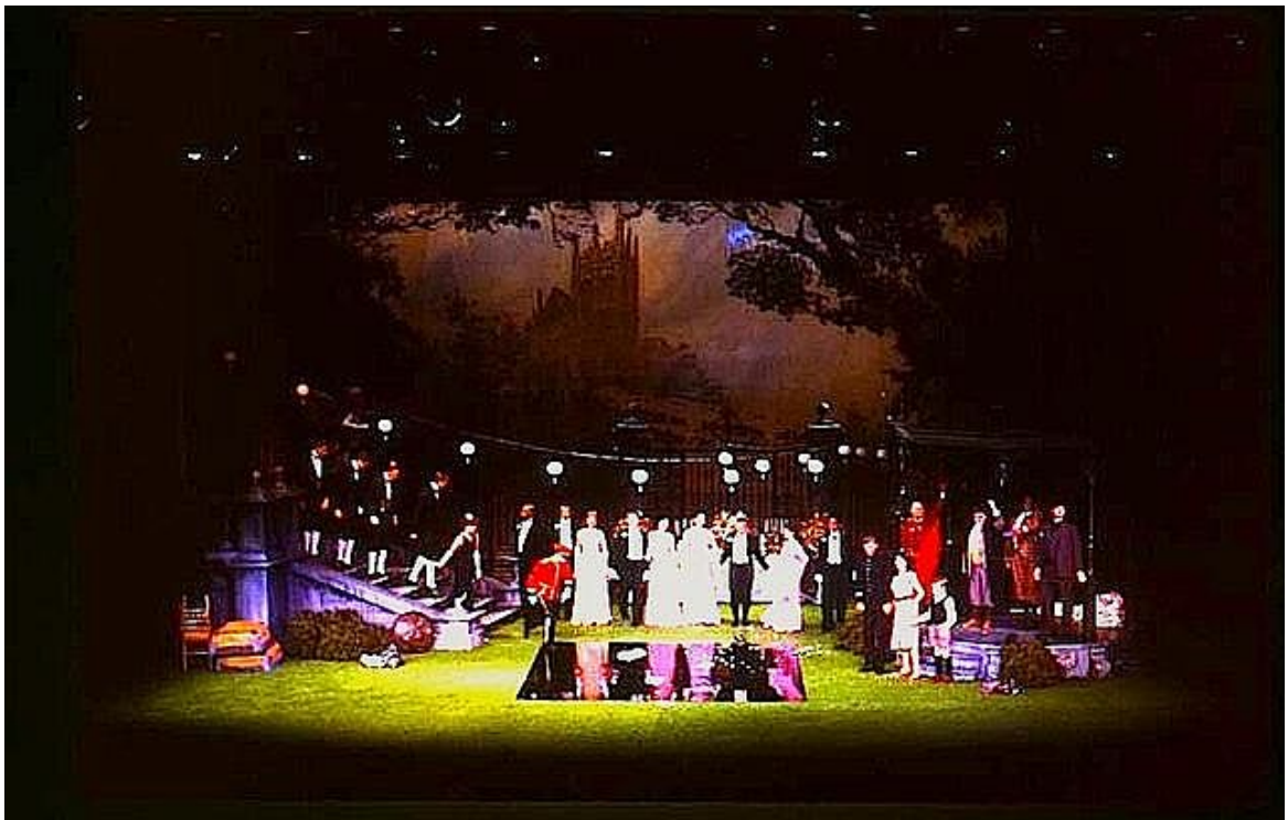
Figure 4. American Repertory Theatre, Cambridge, MA, 1985.