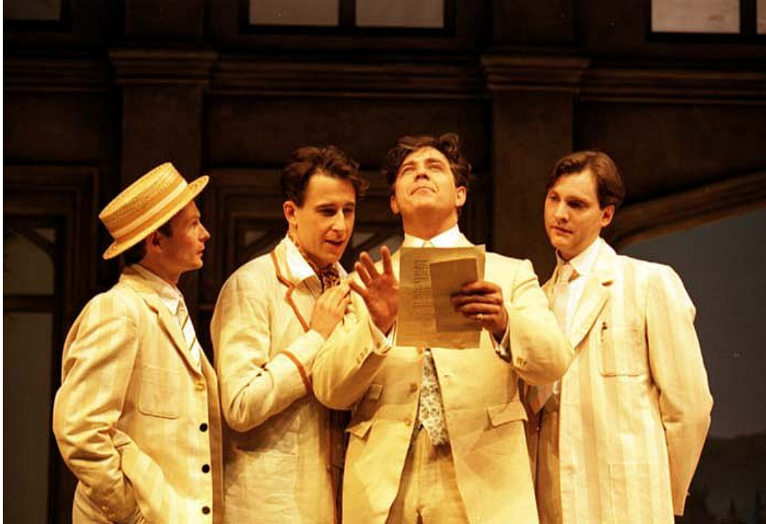
Figure 14. Royal Shakespeare Company, Judge/Gunter, January 1995.

"Ferdinand," "Berowne," "Longaville," "Dumaine." URL: