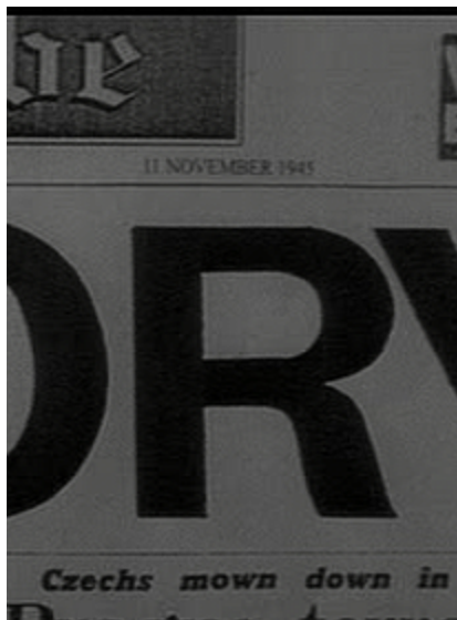
Figure 8. Kenneth Branagh Film DVD Screen Grab Detail.

But November 11 was of course when World War I ended, not World War 2; VE Day in World War II was 8 May 1945, while the Pacific war ended in August 1945. Branagh's conflation of the two wars – surely