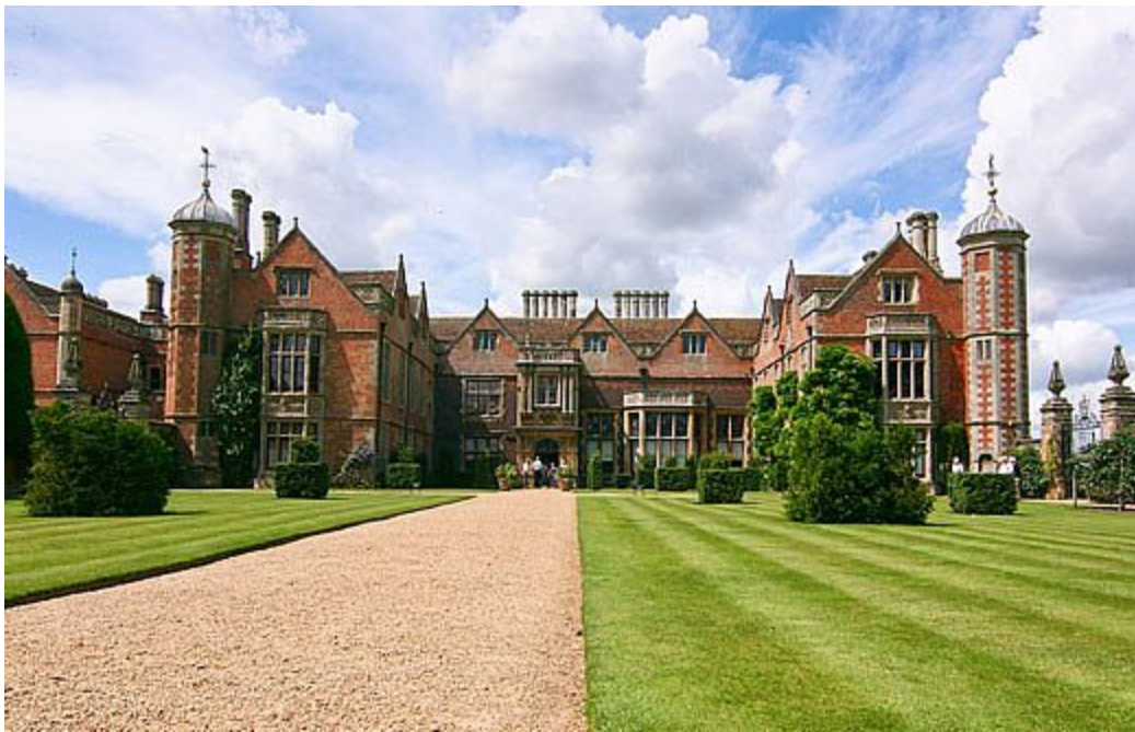
Figure 20. Charlecote Park.