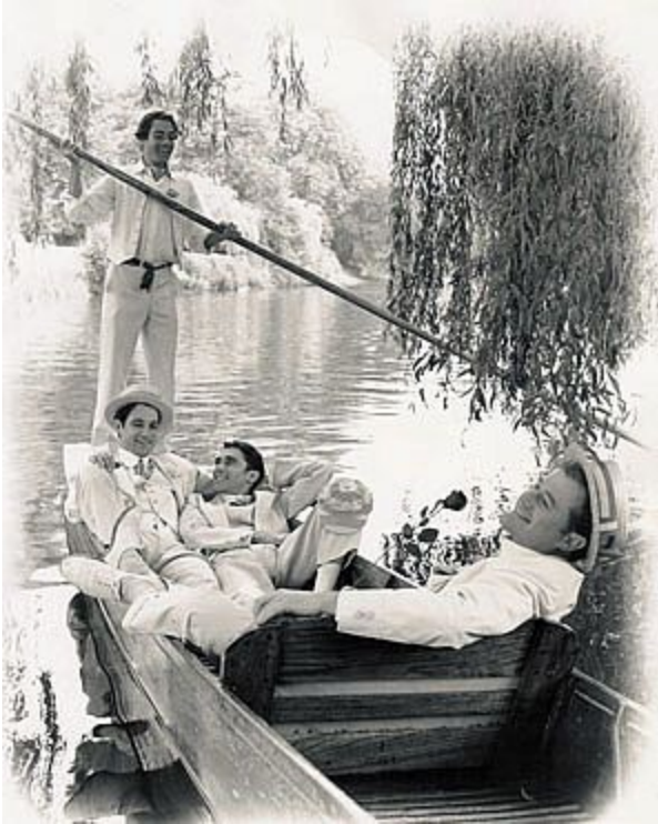
Figure 10. Royal Shakespeare Company, 1993, Ian Judge, director. Program Cover.

"Ferdinand," "Berowne," "Longaville," "Dumaine." URL: http://www.ianjudge.com/plays/loves-labours-lost-rsc