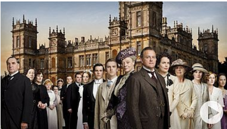
Figure 24. Cast of Downton Abbey . Screen Grab.

URL: http://www.rsc.org.uk/whats-on/loves-labours-lost/production-photos.aspx