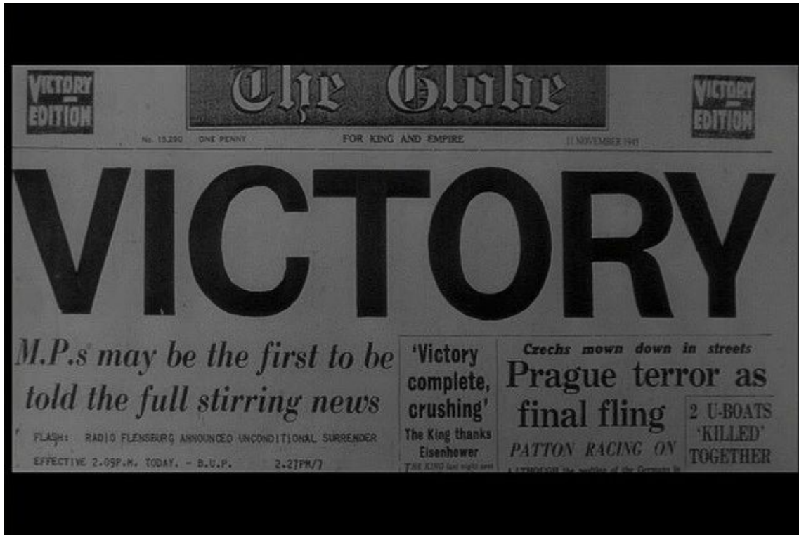
Figure 7. Kenneth Branagh, director, 2000. Screen Grab of DVD.