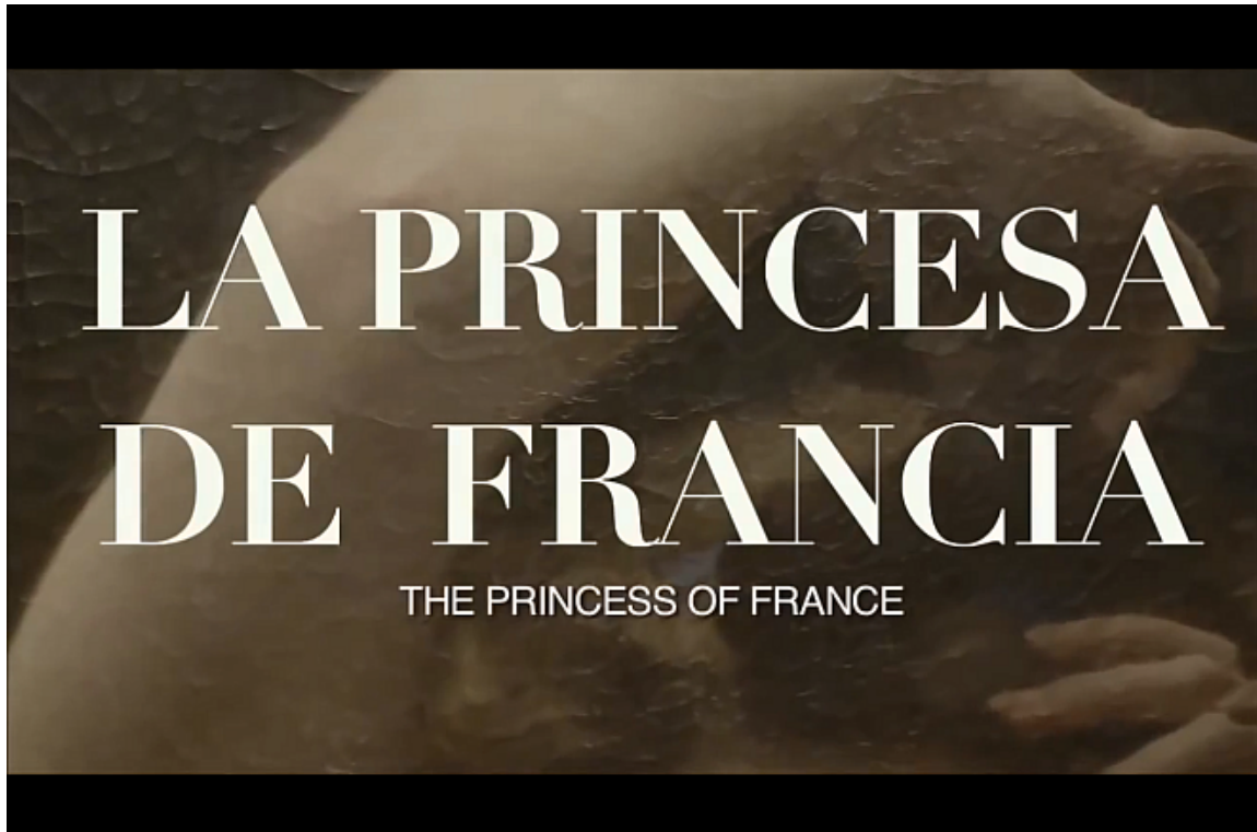
Figure 29. Matias Piñero, The Princess of France, 2014 Trailer. Screen Grab.

URL: https://www.youtube.com/watch?v=AZ7ZceQeqHY