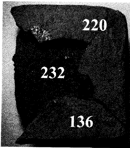
Join of a tablet (Kt 93/k 232) and two pieces of its envelope (Kt 93(k 136 + 220))