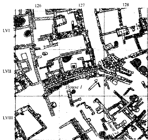
Plan of the area excavated during the 1993 season.

To the second main group of documents discovered in the second house one must add 61 texts unearthed in grid LVIII/128 during the 1994 excavations and belonging to the same archive. 12 Thus, according to the texts' inventory numbers, 868 documents were found in the two houses excavated in 1993, 13 plus 61 texts discovered in 1994 to be added to the second house; for a total of 929 documents.