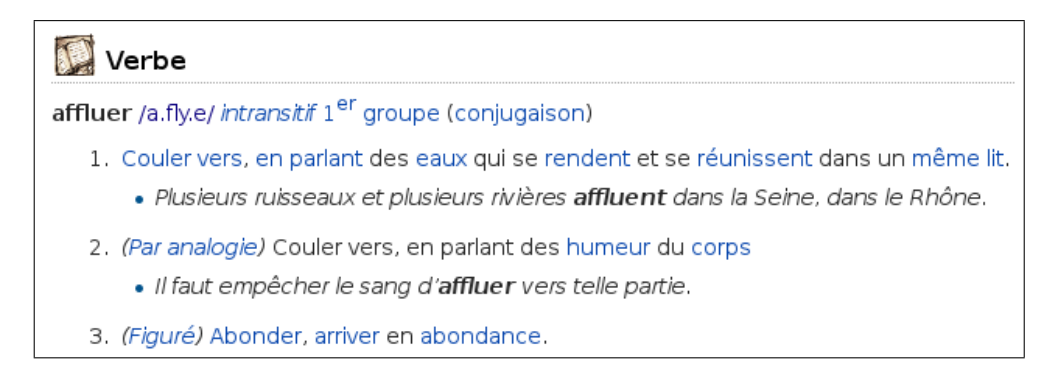
Fig. 2: Excerpt of Wiktionnaire's article affluer

by all the Wikimedia projects. Examples of the encoding format, called wikicode , are given in Figures 1b and 1c.