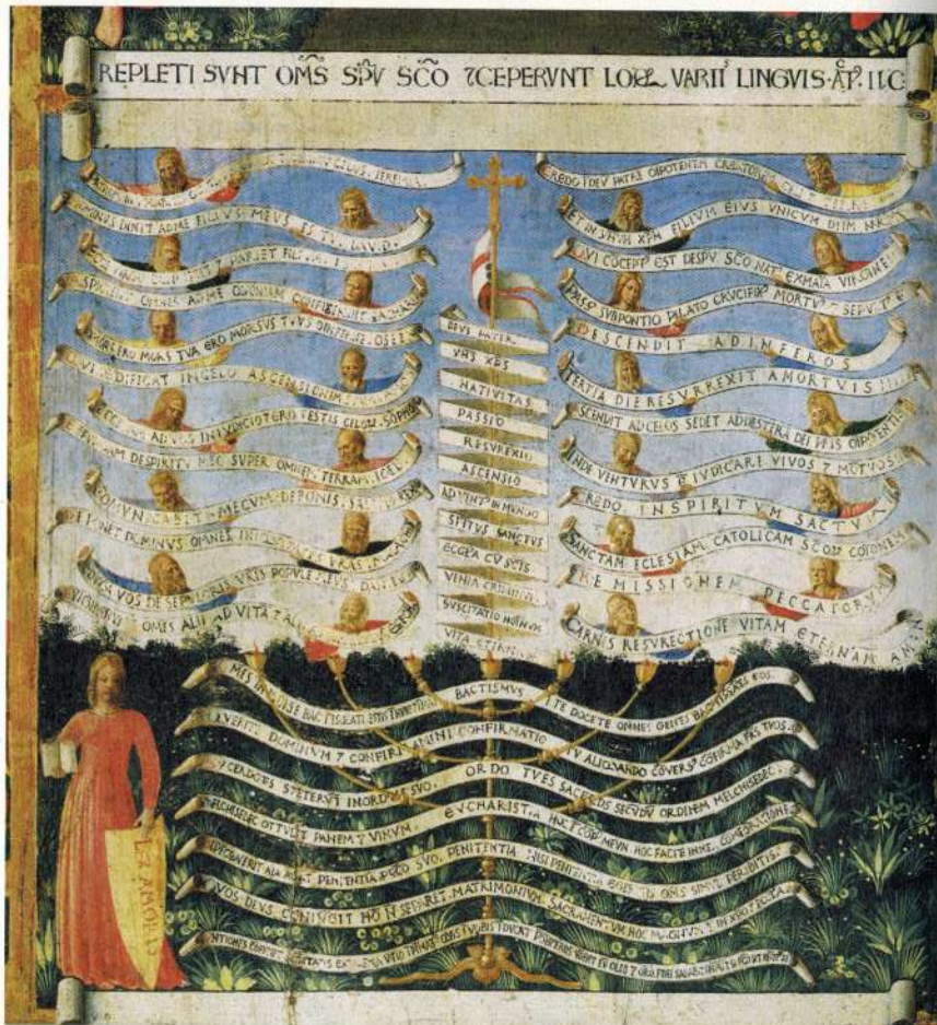
fig. 2 Arbre de Jessé, XV e siècle, Tree of Jesse, 15th century, Fra Angelico, Armadio degli argenti , Florence, Museo nazionale di San Marco.