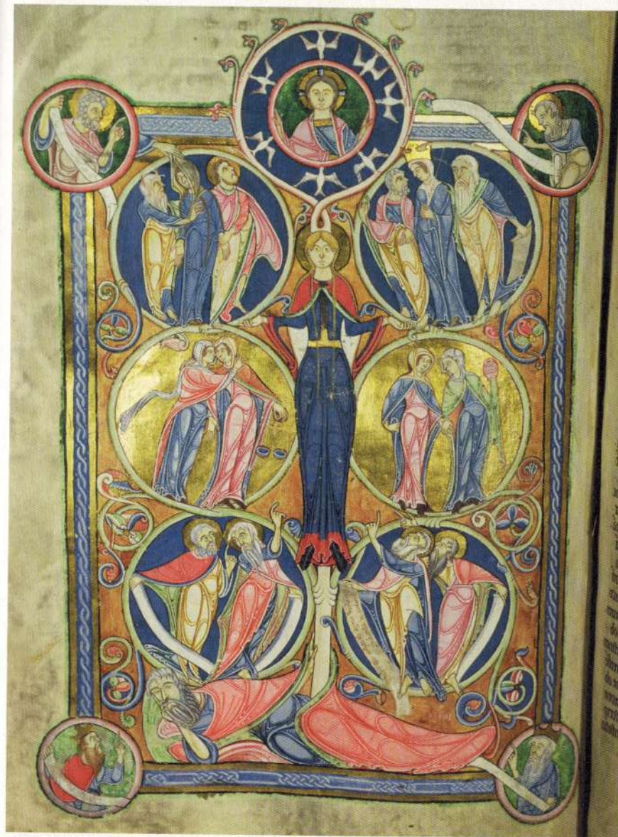
fig. 1 Arbre de Jessé, XII e siècle, Tree of Jesse, 12th century, Lambeth Bible , Londres, Lambeth Palace Library.