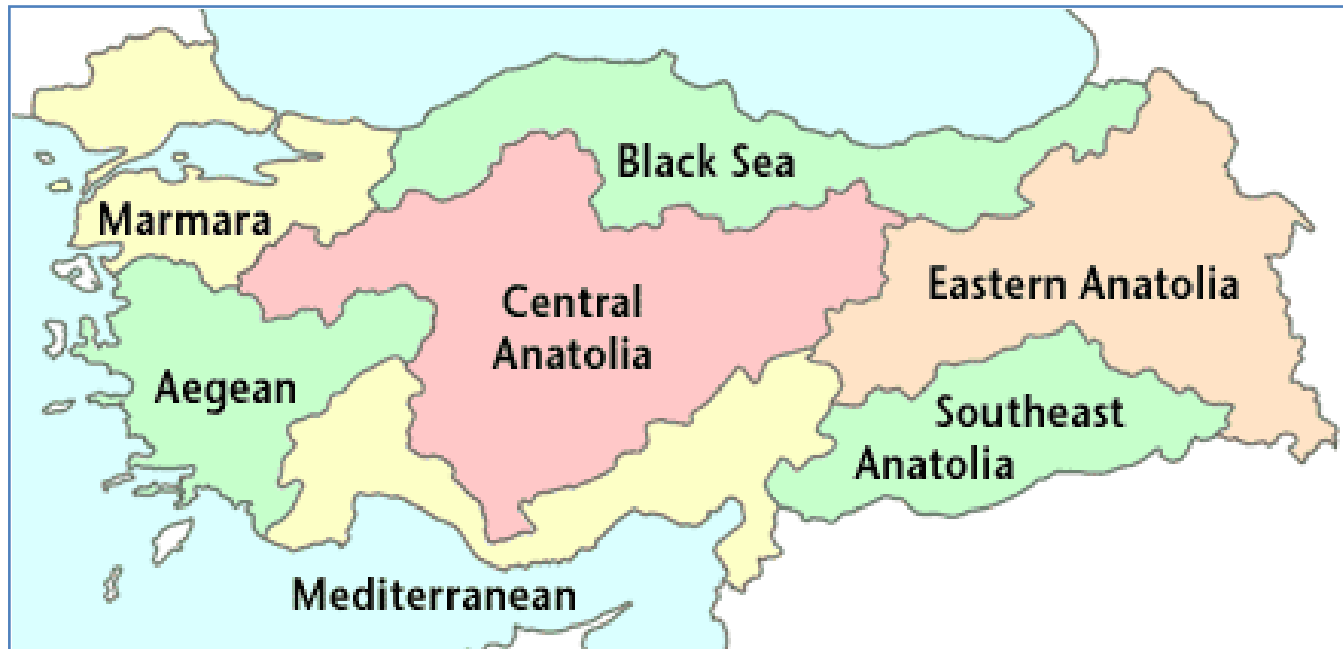
Figure 2. Map of Turkey