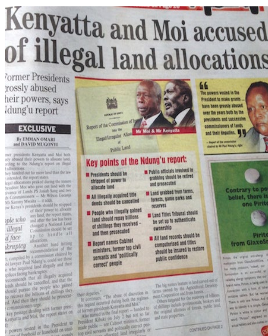
Daily Nation, 7th October 2004

an independent body to take over some of the key functions of the Ministry of Lands and existing abuses. Furthermore, the Njonjo Report recommended that improper allocations be suppressed, and in some cases the land given back to its original owner. The Ndung'u Commission asserts that "sanctity of title depends on its legality and not otherwise. A title acquired illegally is not valid in the eyes of the law". 10 The Ndung'u Report was very documented, showing how Kenyan public officers had betrayed the Public Trust Doctrine in the allocation of public land. It recommends the establishment of a Land Titles Tribunal that would embark in the process of revocation of unlawful titles; it also suggested that a National Land Commission (NLC) be created and vested in the power of managing the allocation of public and trust land. Other crucial recommendations thereafter enshrined in the Policy were: the impediment for foreigners to own land, allowing only leasehold titles in urban areas and recommending the minimization of the delay in granting a renewal.