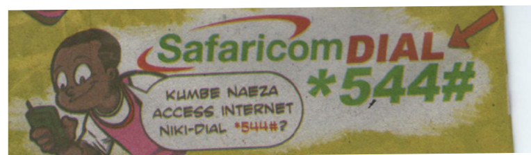
Sheng used in advertising

It is undeniable that Sheng is spreading, and such a spread cannot be stopped. Sheng has become so common in Nairobi everyday communication that a Sheng language manual on CDs called Ultimate Sheng 4 is now sold in supermarkets. This manual targets foreign residents "to make them aware of what is going on around them" as well as parents "to enable them to bond with their children", corporate marketers "to target the youth better", and politicians "to connect with the youth". Sheng is also spreading outside Kenya through an increasing number of Sheng websites and the significant Kenyan diaspora. Therefore, if Sheng has not really changed during the last decade, its expansion throughout Kenyan society is a central aspect of its development, notably showing that it has not been affected by existing negative attitudes toward this language code.