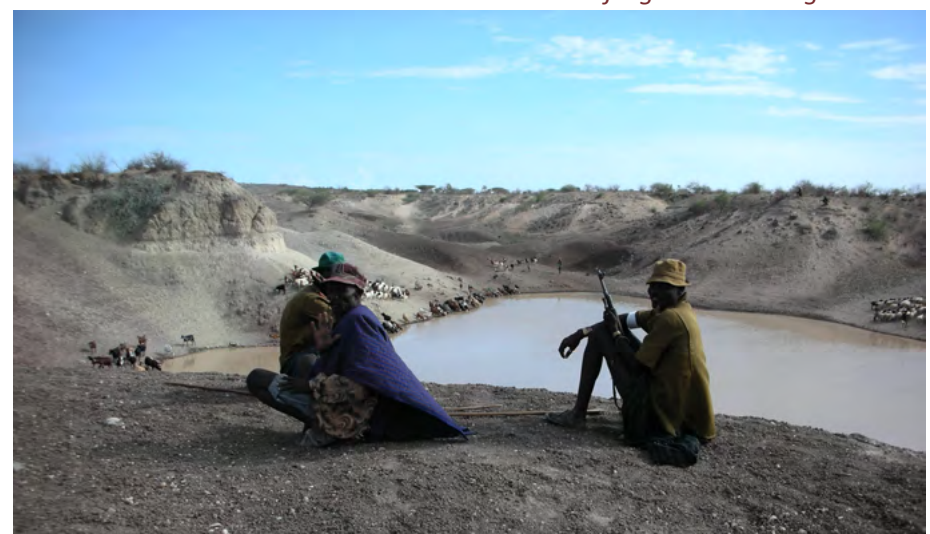
the rest of the group, it is only some selected members of the community who carry out attacks: there is not an involvement of the ethnic group in totality. This explains why the urban areas, unlike rural places, are seen as neutral territories between the two ethnic groups, where interethnic tensions are eased.

In reality, ethnic identities are fluid, and practices, norms and values are exchanged, merged, or reversed, until a conflict sets boundaries and crystallize the ethnic situation, more or less permanently. Ethnic identity is not a factor of control or restriction of the use of resources. The use by the ruling class of such a biased interpretation is a tool for political mobilization. Like religion or culture, ethnicity is manipulated to achieve or maintain a position of power within society. The ethnic criterion does not explain how animosity between ethnic groups arises, or how these ethnic identities can be simple representations used in the