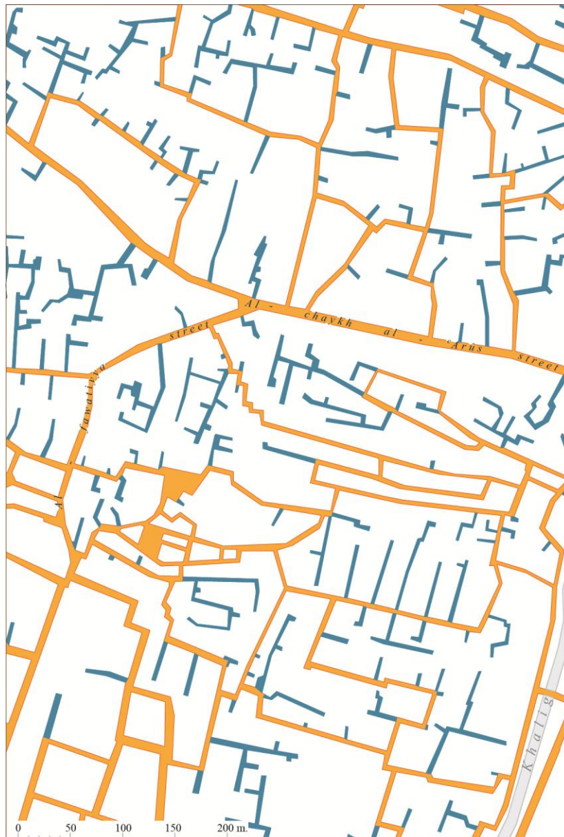
Figure 1. Cairo's old town, an intricate urban system where dead ends (shown in blue) occupy most of the street network (drawing J.-L. Arnaud).

private operation, likely to interrupt or even simply obstruct traffic'; the letter then mentioned cases of encroachment, infringement or abuse as well as a number of measures 'of public interest to be taken by the Police Administration'. Among such measures, the destruction of mastabehs (sidewalks) had been, at least since the French occupation, a recurrent theme in speeches on good urban organisation. The September 1889 decree, which set up the Tanzim Council and organised delegations to major Egyptian cities, specified the rules of alignment and again ordered the suppression of mastabehs 'existing outside constructions', except for 'historic, religious or art buildings, until their facades had been rebuilt on the line'. Article 9 of the 13 July decree of the same year offered some definitions: 'private individuals cannot open public streets without prior authorization and without first, as a rule, surrendering to the State free of charge the land