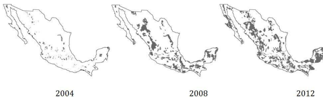
Figure 1: Evolution of eligible areas

The above elements tend to show that CONAFOR conceived the PSA-H as a compensation mechanism as it targets threatened forest and as the amount of payments are intended to reflect income loss attributable to conservation. As highlighted above, interactions with civil societies and other groups of interest forced CONAFOR to consider other conceptions of PES and integrate new objectives. This hybridization may be responsible for the low additionality observed in the early cohorts of beneficiaries (Muñoz-Piña et al., 2008; Muñoz Piña et al., 2011; Alix-Garcia et al., 2012). Nevertheless, Sims et al. (2013) highlight that, through adaptive management of the targeting criteria, the designers succeeded over time at combining both objectives.