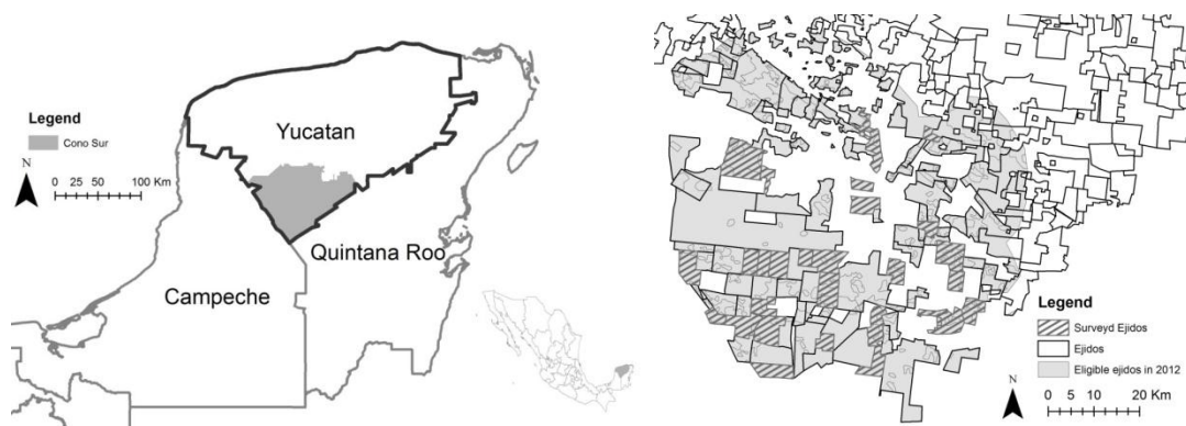
Figure 2: The Cono Sur of Yucatan

Ejidors from the southern part of our study zone lack basic infrastructure such as roads, running water and electricity and have been partly deserted by the population. This has led to the formation of labor- ejidos where ejidatarios maintain economic activities but live in the nearest city. In our sample, about 45% of the households do not live in their ejido . The average size of an ejido in our sample is about 2,500 ha and the average number of ejidatarios is 75.