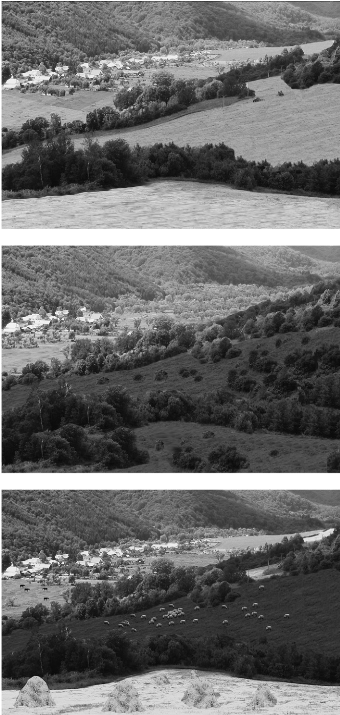
Fig. 2–4. Example of a scenario visualisation series from the Slovakian study area. 2. Business as Usual; 3. Agricultural Liberalisation; 4. Managed Change for Biodiversity (photographs: P. Bezák, photo editing: Martin Boltiziar; note that full colour prints were used for the stakeholder assessments).

Wilding : The Wilding scenario was developed for the French, Scottish and Norwegian study areas. Like the MCB scenario, it is based on the assumption of complete agricultural liberalisation and it also embodies biodiversity conservation as an overarching policy goal. The main difference from MCB is that its conservation objectives are based around more radical biodiversity futures and refer to the conservation and re-establishment of landscape ecological processes rather than species and habitat objectives. Furthermore, large predators may, in some cases, be re-introduced. It represents a “managed re-wilding” approach