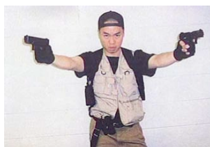
Figure 11. Seung-Hui Cho pointing two guns