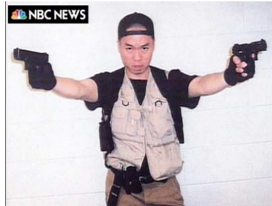
Figure 5. Self-portrait of Seung-Hui Cho with a black cap