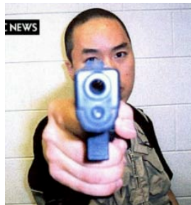
Figure 10. Seung-Hui Cho aiming at the camera

The mimicry nature of these images relates to a visual universe and a form of ritualization in the self-posing process so characteristic of this phenomenon. This interpretation is supported by later school shooting cases, as attest the two series of images produced by Seung-Hui Cho (responsible for the Virginia Tech massacre, USA, in 2007. cf. Figures 13 to 15) and Wellington De Oliveira (responsible for a school shooting in Brazil in 2011. cf. Figures 10 to 12). They undeniably relate to the same visual universe, to the same communicational and audiovisual scenario in the school shooting cultural script. These scenarios clearly find their references in movies: Figures 11 and 14 relate, for example, to situations in which an action film hero holds a gun in each hand to get rid of the enemy surrounding him.