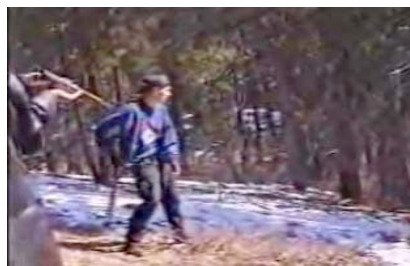
Figure 17. Columbine school shooters trying out their weapons and testing their ability to shoot