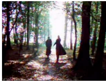
Figure 18. Bastian Bosse in a shooting session with a mate

If this pioneer recording by the Columbine school shooters seems more like playful shooting practice, it is not the same for the other videos in our corpus. As with self-portraits, these video sequences are the result of a constructed scenario. The video produced by Bastian Bosse is the most striking example (cf. video T048); it is an audiovisual remix whose purpose is to glorify its author through sequences filmed outside, with the Dope's song " Die Mother Fucker Die " as background music. This is an interesting example because this remix is filled with references to Columbine: wearing a black trench coat, Bosse poses with a friend (Figure n°18); he shares scenes from his everyday life, like listening to music while driving; he films himself with tear gas, echoing Harris and Klebold's use of homemade bombs and Molotov cocktails.