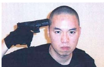
Figure 12. Seung-Hui Cho pointing the gun at his head