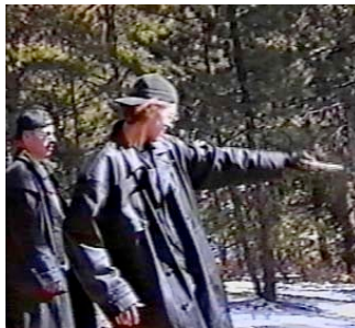
Figure 4. Exhibition of the Columbine school shooters in black trench coats and black caps

Among them, we can note a long black trench coat and black cap (cf. Figure n°4). It is the two Columbine school shooters, Eric Harris and Dylan Klebold, who contributed to making this attire an essential part of the visual culture in this subversive movement (Ogle & Eckman, 2002). Not only were they wearing this attire when they committed their murderous act, but they also wore it on an everyday basis, for example when they attended classes. The fact that Eric and Dylan wore black trench coats may refer back to a previous shooting in which Barry Loukaitis wore a black raincoat the day he assassinated three people in February 1996. It seems that Barry was inspired by the main character in Matrix , Neo, when he adopted this style (Coleman, 2004).