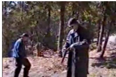
Figure 16. Columbine school shooters (Eric Harris left & Dylan Klebold right) at a shooting session in the woods

Some of the audiovisual recordings made by school shooters contain a format that could be called "Shooting practice" since they pose during shooting practice, either at the shooting range or in the woods. Compared to recordings dealt with previously in which the killers face the camera and justify their acts, these sequences are particularly short. Here again, the first ones to have produced this type of content were the two Columbine school shooters (cf. video T045; Cf. Figures 16 and 17).