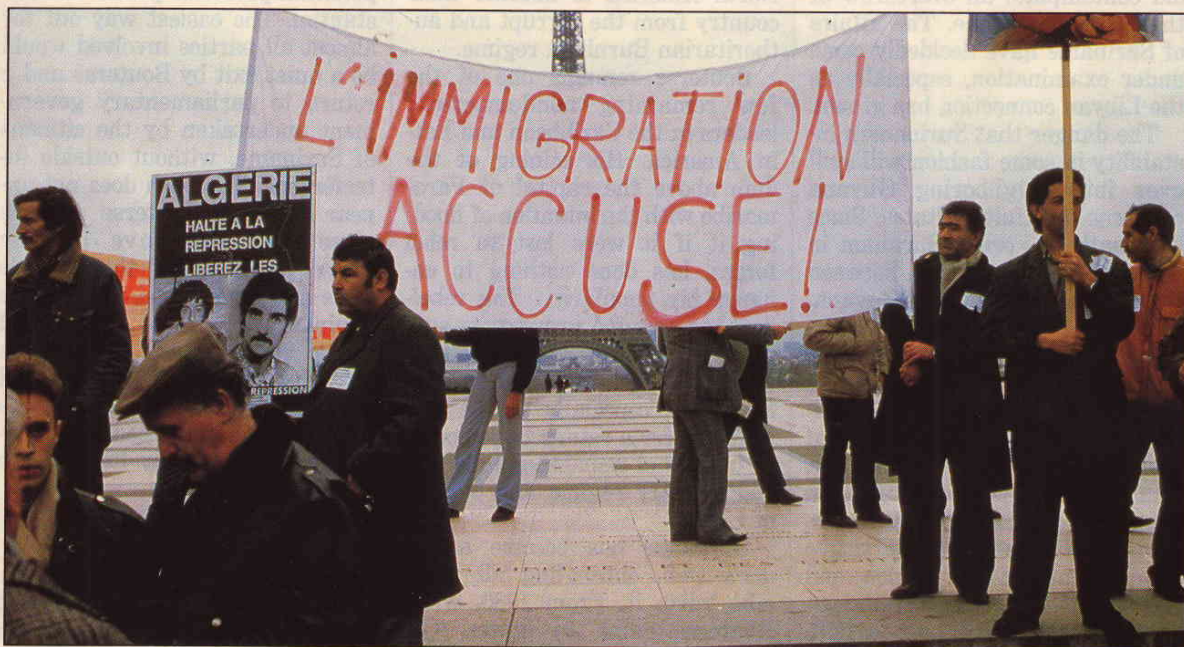
Members of the League of Human Rights demonstrate in Paris against alleged "Algerian repression."

The fact of the matter is that the reform proposed by the government is at the heart of the immigration debate. The French evoke the specter of racism and others the specter of immigration