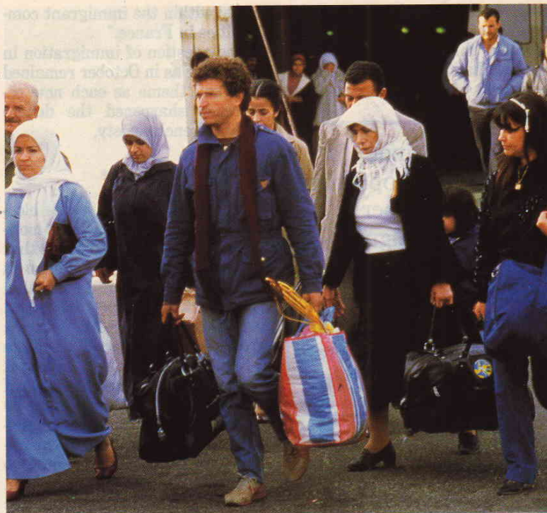
Algerians arriving in France fresh off the boat Zeralda .

Paris, October 1986: The French government chartered a plane to expel 101 Malians living illegally in France, a quarter of