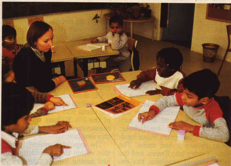
Non-French-speaking children in Paris are given an orientation to life in France.

These figures need clarification. First of all, figures are presented for the number of foreigners, that is, persons not having