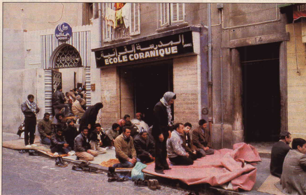
North African Muslim immigrants praying near a mosque in Marseille. Islam is now the number two religion in France.

T he Muslim world has taken on increased significance in France, where Islam has become the second religion. Mosques and places of prayer are being constructed in numerous French cities.