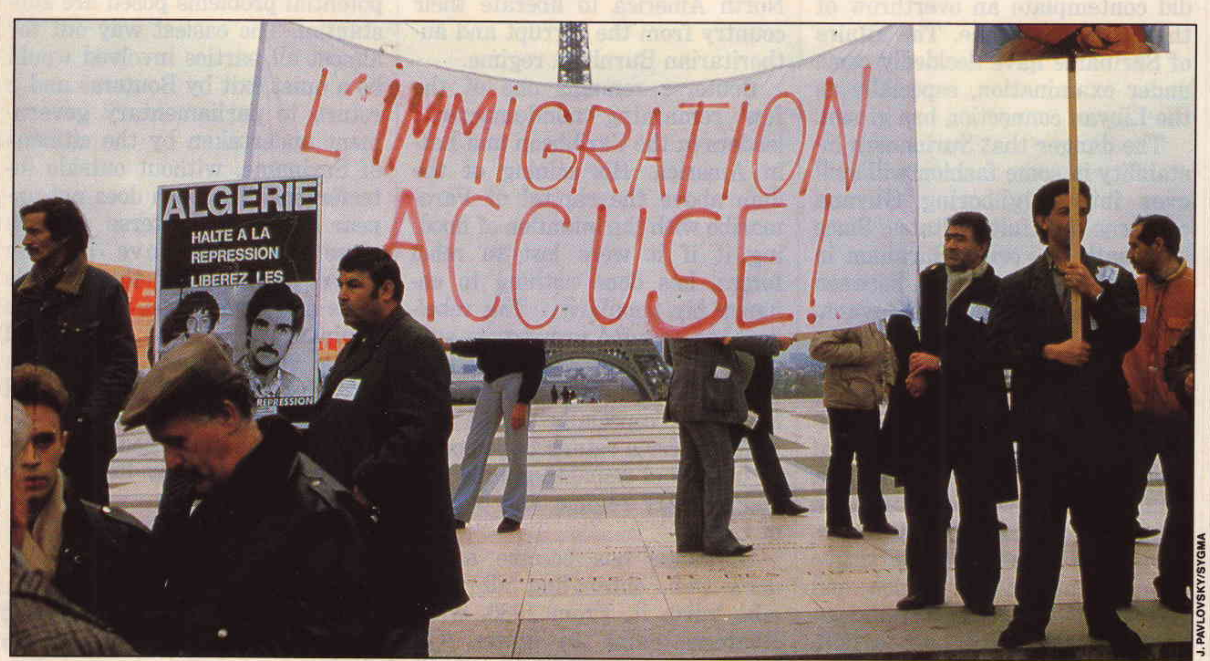
Members of the League of Human Rights demonstrate in Paris against alleged "Algerian repression."

The fact of the matter is that the reform proposed by the government is at the heart of the immigration debate. The French evoke the specter of racism and others the specter of immigration