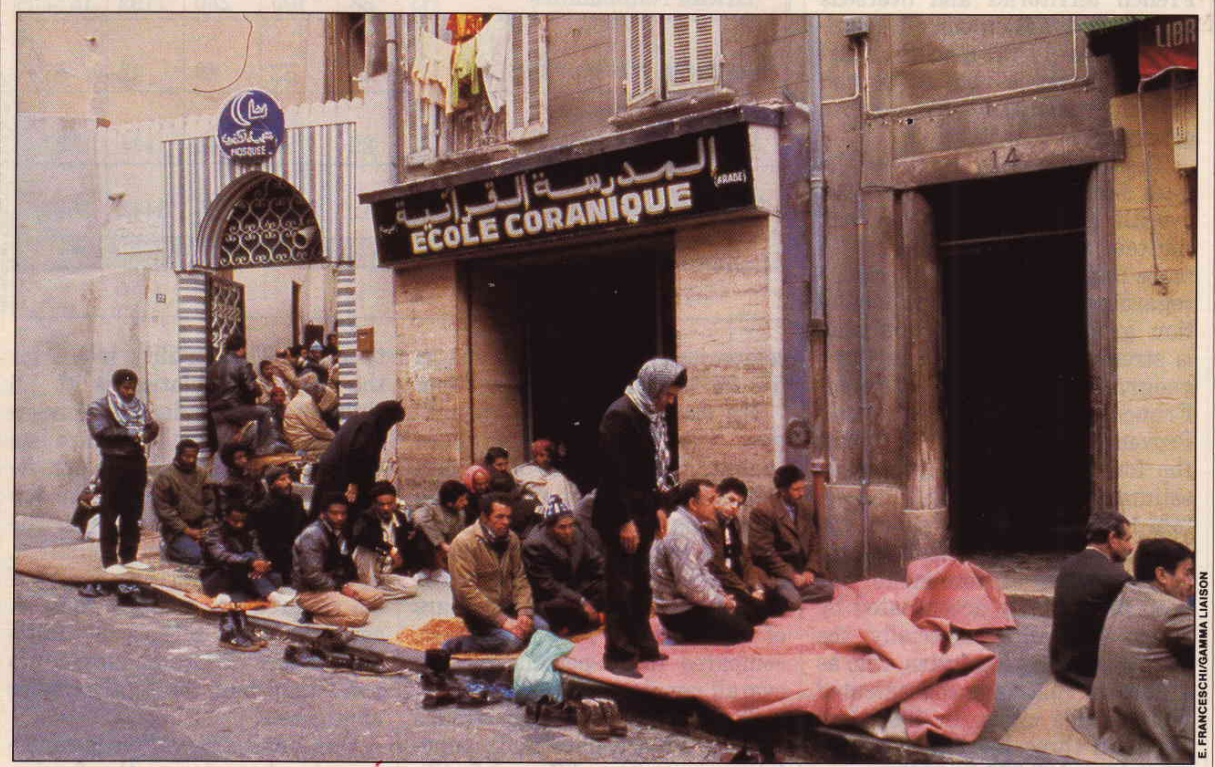
North African Muslim immigrants praying near a mosque in Marseille. Islam is now the number two religion in France.

The "melting pot" functioned very well. For example, the Polish came in large numbers after World War I to replace French manpower depleted during the war, mostly in the mines in the north and in Lorraine; they adapted easily to France. They consider themselves well integrated into French society and do not