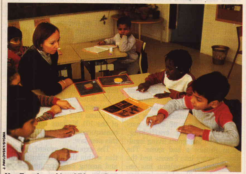
Non-French-speaking children in Paris are given an orientation to life in France.

These figures need clarification. First of all, figures are presented for the number of foreigners, that is, persons not having