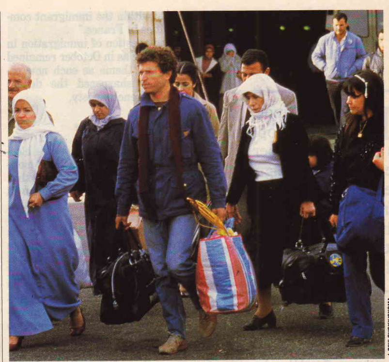
Algerians arriving in France fresh off the boat Zeralda.

Paris, October 1986: The French government chartered a plane to expel 101 Malians living illegally in France, a quarter of