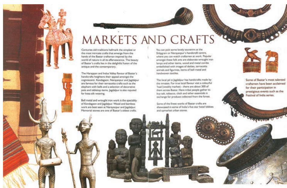
FIGURE 3. Pamphlet published by the CHHATTISGARH TOURISM BOARD 2002.