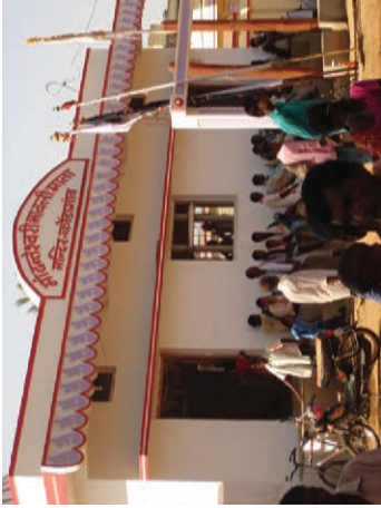
FIGURE 10. Newly built or transformed temples in the marketplace at Kondagaon, 2011.