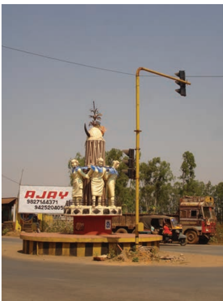
FIGURE 6. New monument at a crossroad in Jagdalpur, 2011.