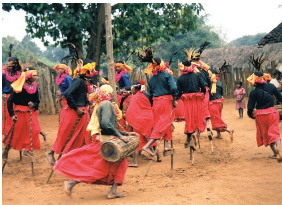
FIGURE 1. Ghotul stilt dance at Balenga Para, 2000.