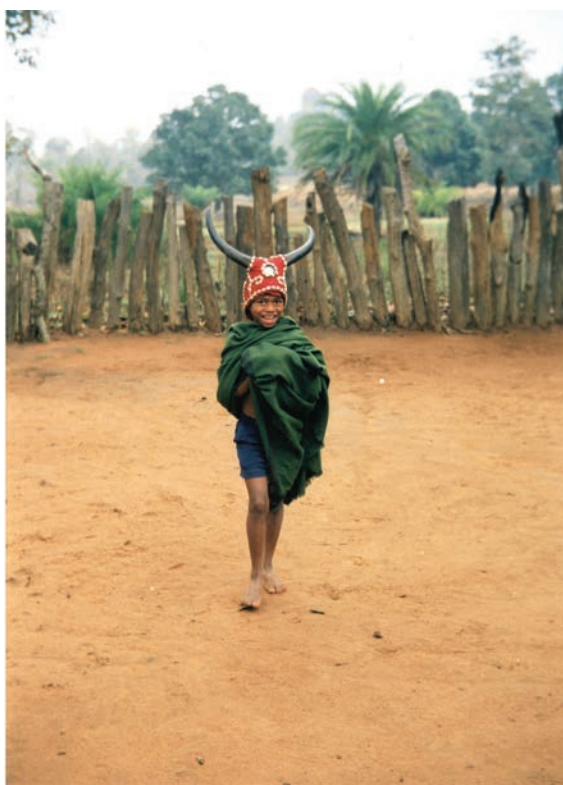
FIGURE 7. Horn headdresses worn in recent years by ghotul Muria for their shows, 2002.