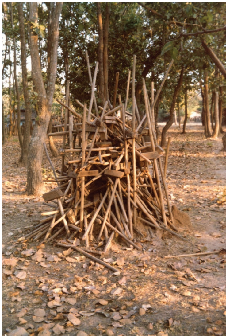
FIGURE 9. Piles of stilts at the outskirts of a village, 2002.

these choreographies were already being performed ritually in the villages. 29 However, as deity-instruments, the rattle-stilts used to be built exclusively at the beginning of the monsoon and had to be ritually broken at the end of the monsoon on the stone of Goronđi Deo (lit. the “stilt deity”) to whom offerings and sacrifice were made by the ghoṭul members (ELWIN 1947; PRÉVÔT 2005). This is still the case in many villages (see FIGURE 9). However, the status of the performance and the instrument have already changed. The competition, among other influences, therefore has a direct impact on village ritual practices.