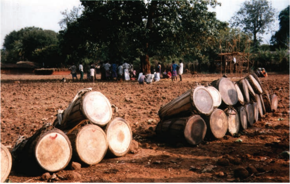
FIGURE 8. Mandir drums ready for offerings before being played at a wedding at Kharsing, 2001.

the culture of Bastar. 24 Since none of them belong to Gond culture, the question of the criteria used to evaluate the performances arises. Their own cultural references necessarily determine or affect their judgment, which consequently influences the aesthetic choices of the performers themselves. A few years ago, a Gond teacher who was a lecturer at the high school was invited to join the organization, but he did not belong to the jury. His knowledge of Hindi as well as the local languages and culture now allows him to comment on the show, which he does by addressing the various audiences with a microphone. For this special event a white turban wrapped in the tribal manner allows him to be recognized as the only ādivāsī representative among the organizers. Ironically, he does not normally wear the turban.