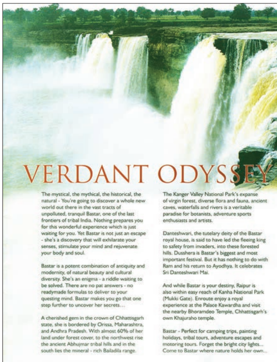
FIGURE 2. Pamphlet published by the CHHATTISGARH TOURISM BOARD 2002.

females. 7 While some jungle villages have somehow managed to preserve their ghoṭul as a vital and fundamental institution, others, surrounded by rice fields or in open country, maintain something that increasingly resembles a “dancing club.” 8