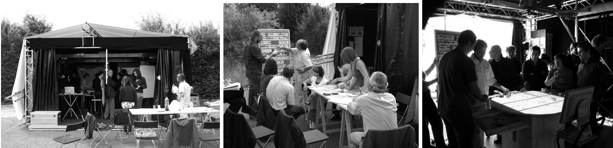
Figure 6, 7 & 8: The MR tent and the Quartier Bossut workshop

redefine the main theme for the new trial as general strategies of development rather than design issues. The participants will be asked to discuss on the site and its future in relation with their respective knowledge and experience of the city and their expectations: the objective is to decide on a number of development strategies that will serve the design team as guidelines during their work. This does not demand the use of sophisticated architectural models etc. and should facilitate compatibility issues with technologies. The participants will be using simple 3D models, images, textures, sounds and inspirational objects: this visual material will be generic and/or common enough to make them recognizable for different participants and to ensure a certain level of coherence. They will enable the participants to collectively work on the scenario and to create mixed reality urban scenes.