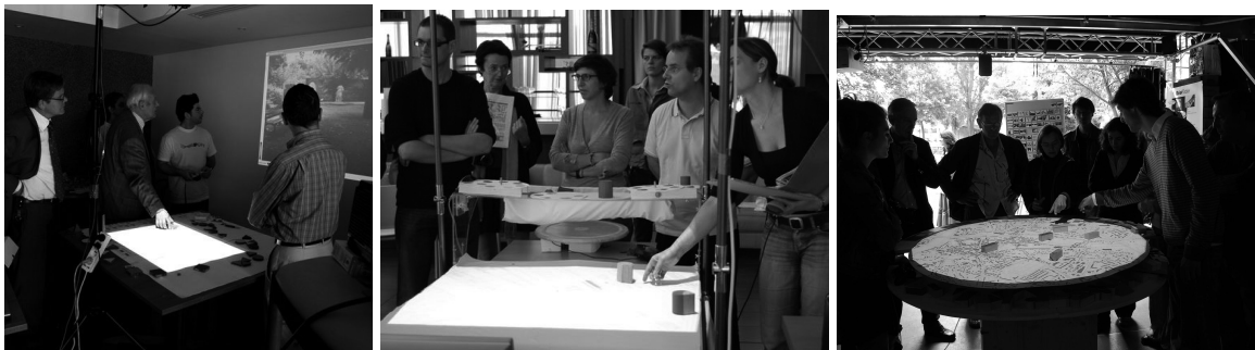
Fig.3, 4 & 5: the workshops at the psychiatric hospital of St.Anne, the new Paris courthouse and the public gardens of Lavandières in Pontoise

The Quartier Bossut field trial that took place in 2008 in Cergy-Pontoise will be the main focus of the third part of this paper where issues related to participation selection, scenario building, representation issues and content selection as well as the trial will be discussed in more detail.