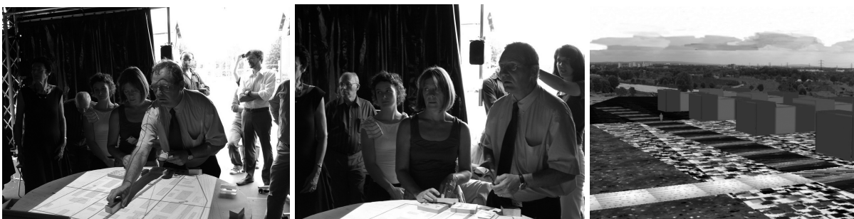
Figure 9, 10 & 11: Participants working with the technologies

The workshop has taken place in the MR tent that has been installed in the central public space, the Place d'Armes , of the Quartier Bossut . The participants have been regrouped in two teams with similar participant configuration and each team has worked during one day on the proposed scenario with the MR technologies. The morning session has been used for the initiation of participants to technologies: this is followed by a presentation of the scenario and the main questions that will be discussed. The afternoon session has been reserved to group work: the contribution of the research team to this session has been limited to intervening if and when a blackout occurs and to informing the participants on technical and/or urban issues if and when the participants wish. A debriefing session organised at the end enables the research team to have feedback from the participants on those issues that interest the different research groups. This debriefing as well as the recordings made with different media during the day serve as the basis of the analysis work to be done.