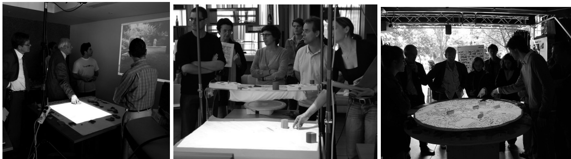
Fig.3, 4 & 5: the workshops at the psychiatric hospital of St.Anne, the new Paris courthouse and the public gardens of Lavandières in Pontoise

The Quartier Bossut field trial that took place in 2008 in Cergy-Pontoise will be the main focus of the third part of this paper where issues related to participation selection, scenario building, representation issues and content selection as well as the trial will be discussed in more detail.